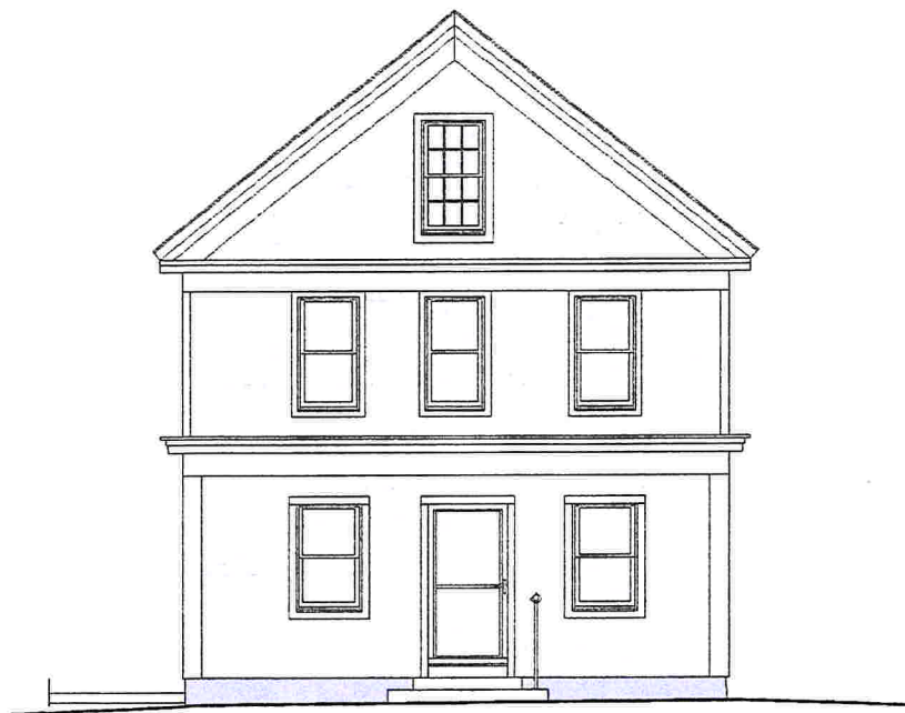
FRONT ELEVATION SCALE: 3/8" = 1'-0"