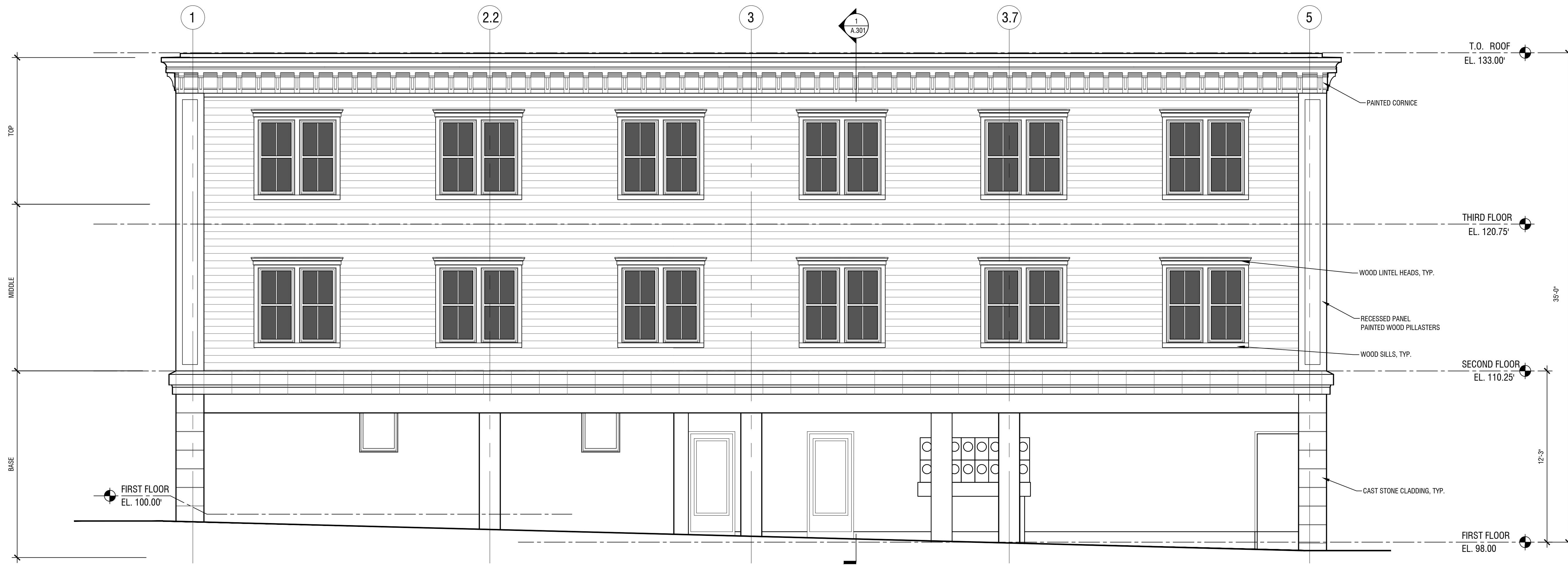
1 SOUTH ELEVATION SCALE: 1/4" = 1'-0"