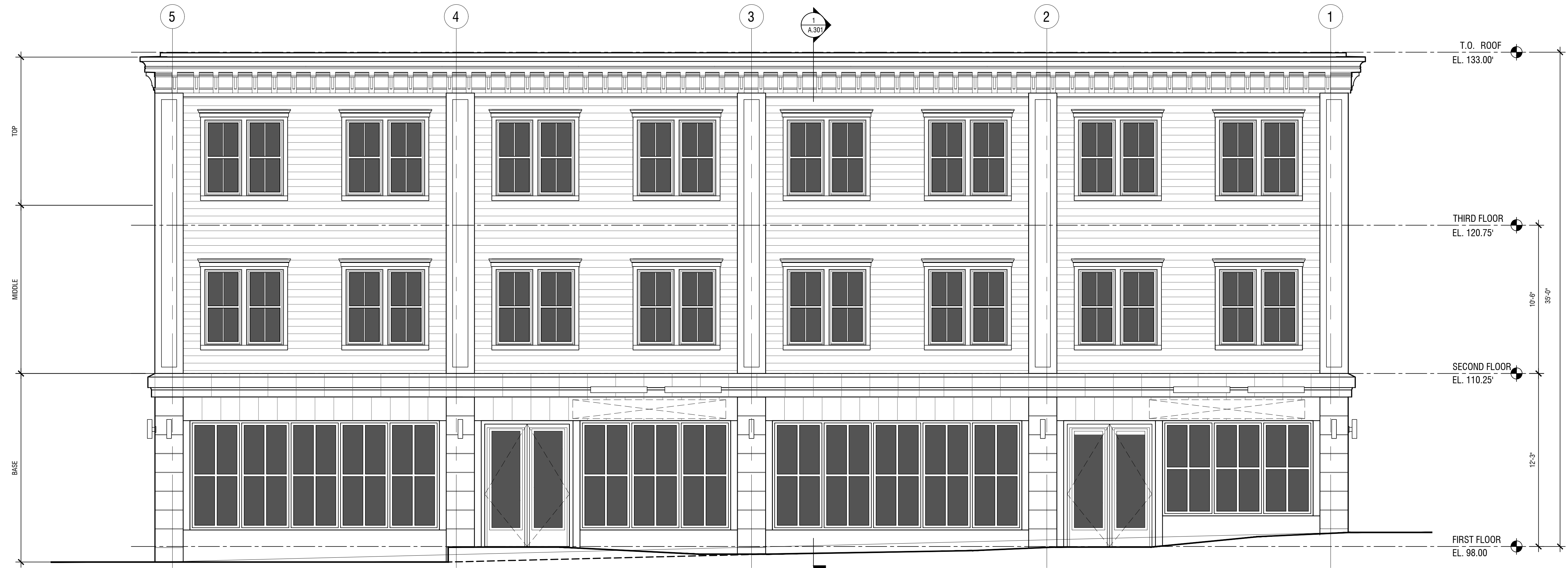
1 NORTH ELEVATION - MAIN STREET SCALE: 1/4" = 1'-0"