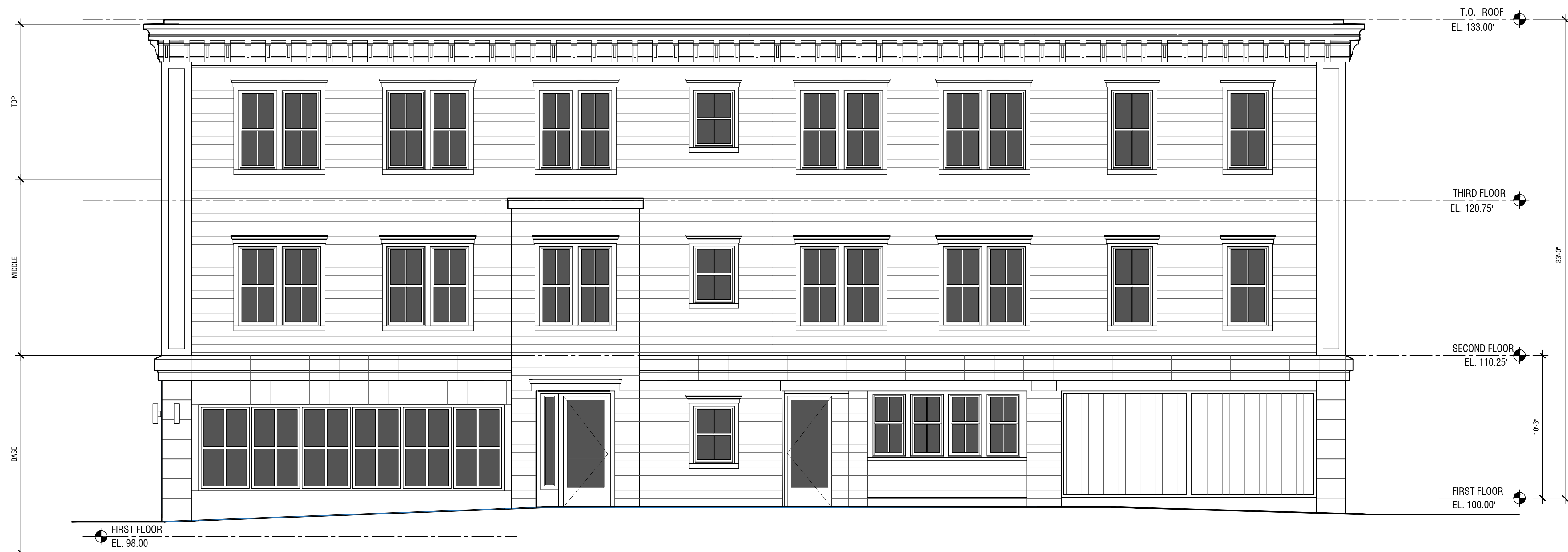
2 WEST ELEVATION - SOUTH STREET SCALE: 1/4" = 1'-0"

REVISIONS: REVISION 01 2022.05.05 - EXTERIOR SIDING CHANGE REVISION 02 2022.05.11 - PB SUBMISSION