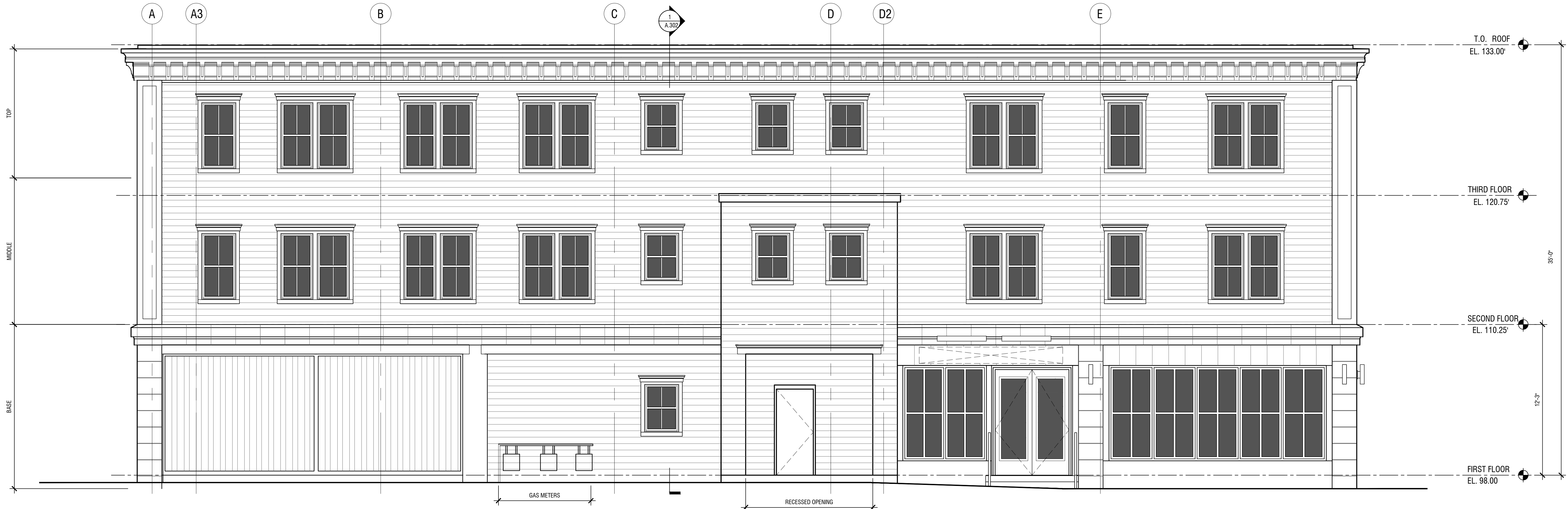
2 EAST ELEVATION - RAILROAD SQUARE SCALE: 1/4" = 1'-0"