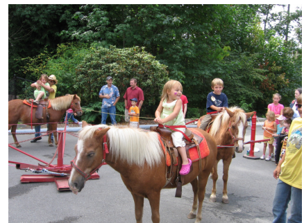
Everyone loves a good pony ride!