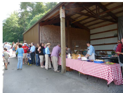
Tasty barbecue served by your Town Council Members and Planning Commissioners