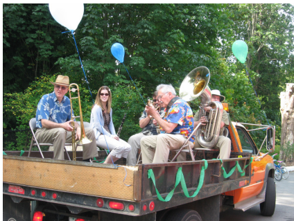
The Uptown Lowdown Jazz Band provided entertainment