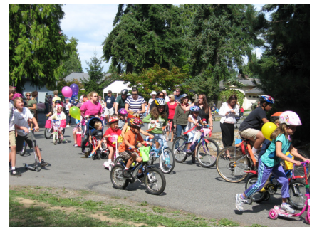
Residents of all ages took part in the annual bike parade