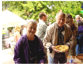
Champion Pie Awarded to Official Woodway Stewards