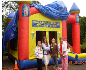
Some of our wonderful student volunteers