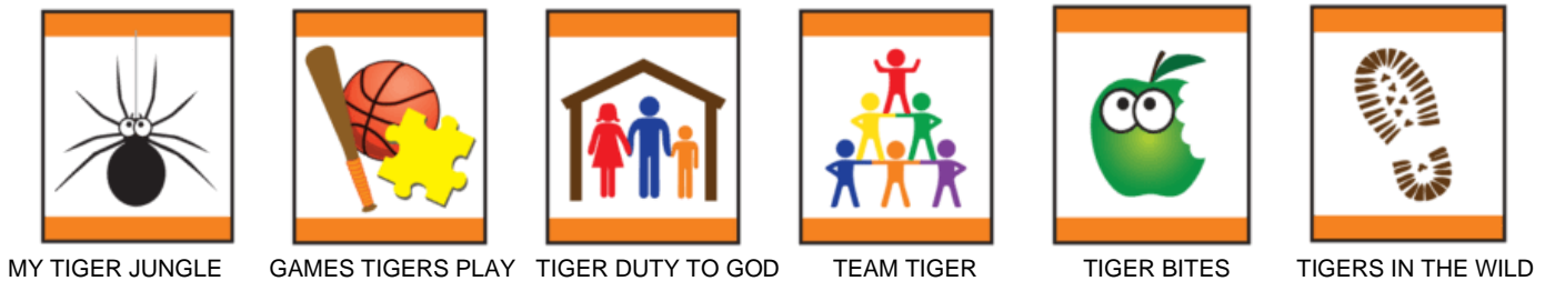
MY TIGER JUNGLE