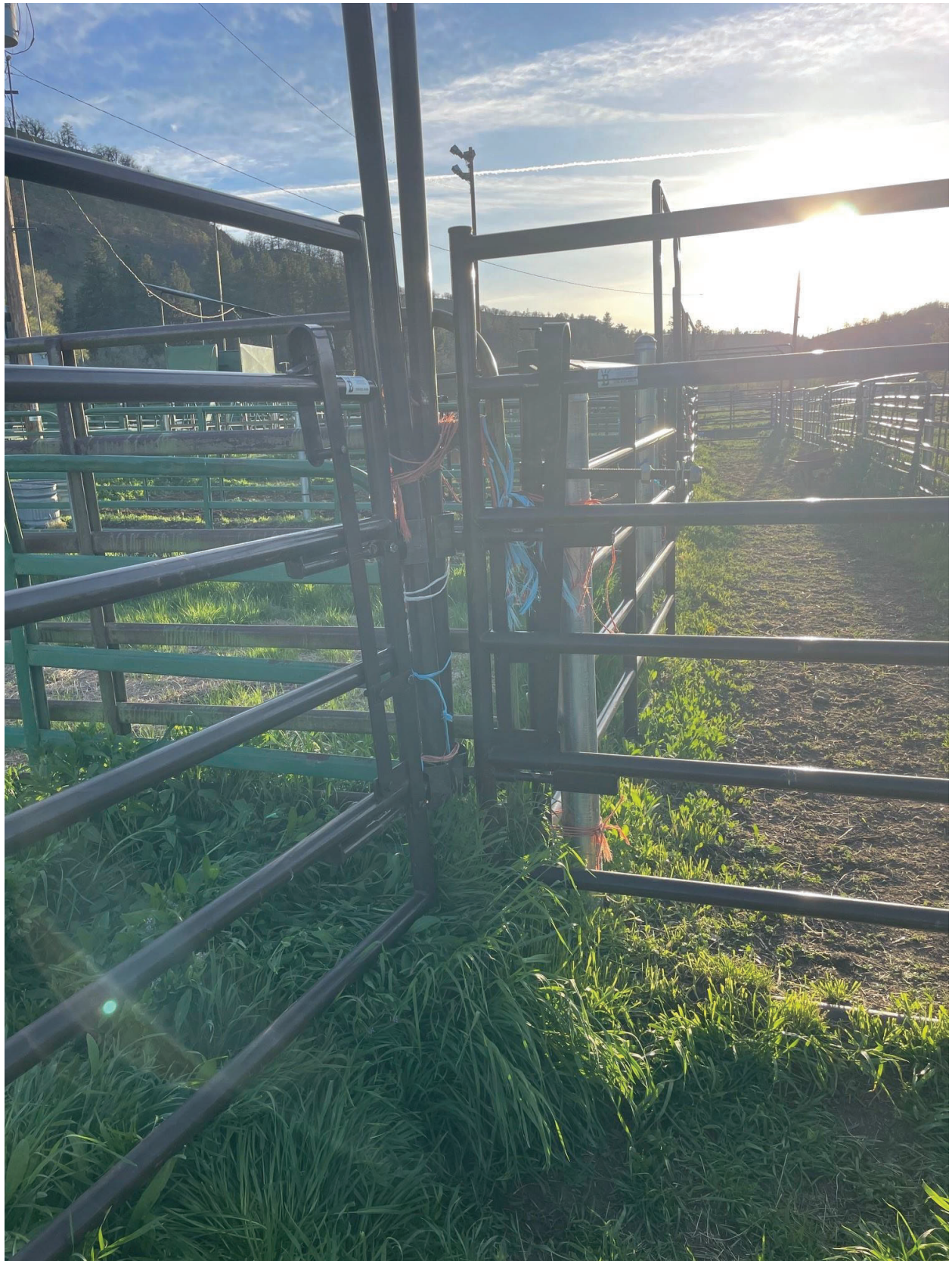
Back Pens – Baling Twine