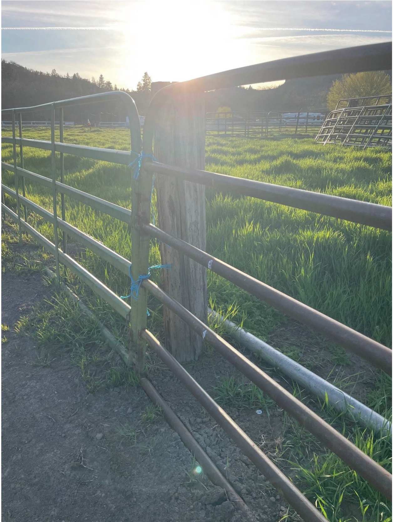
Panels not attached to post and baling twined