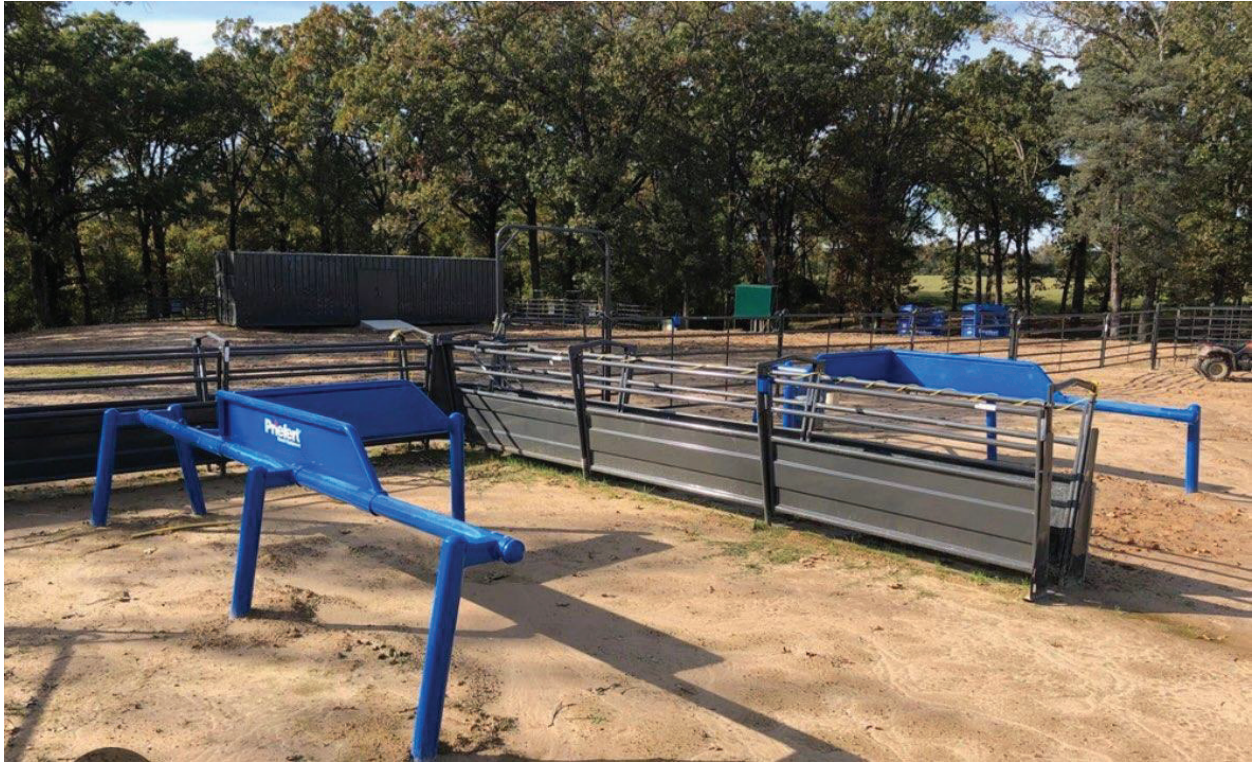
Rope Box 1