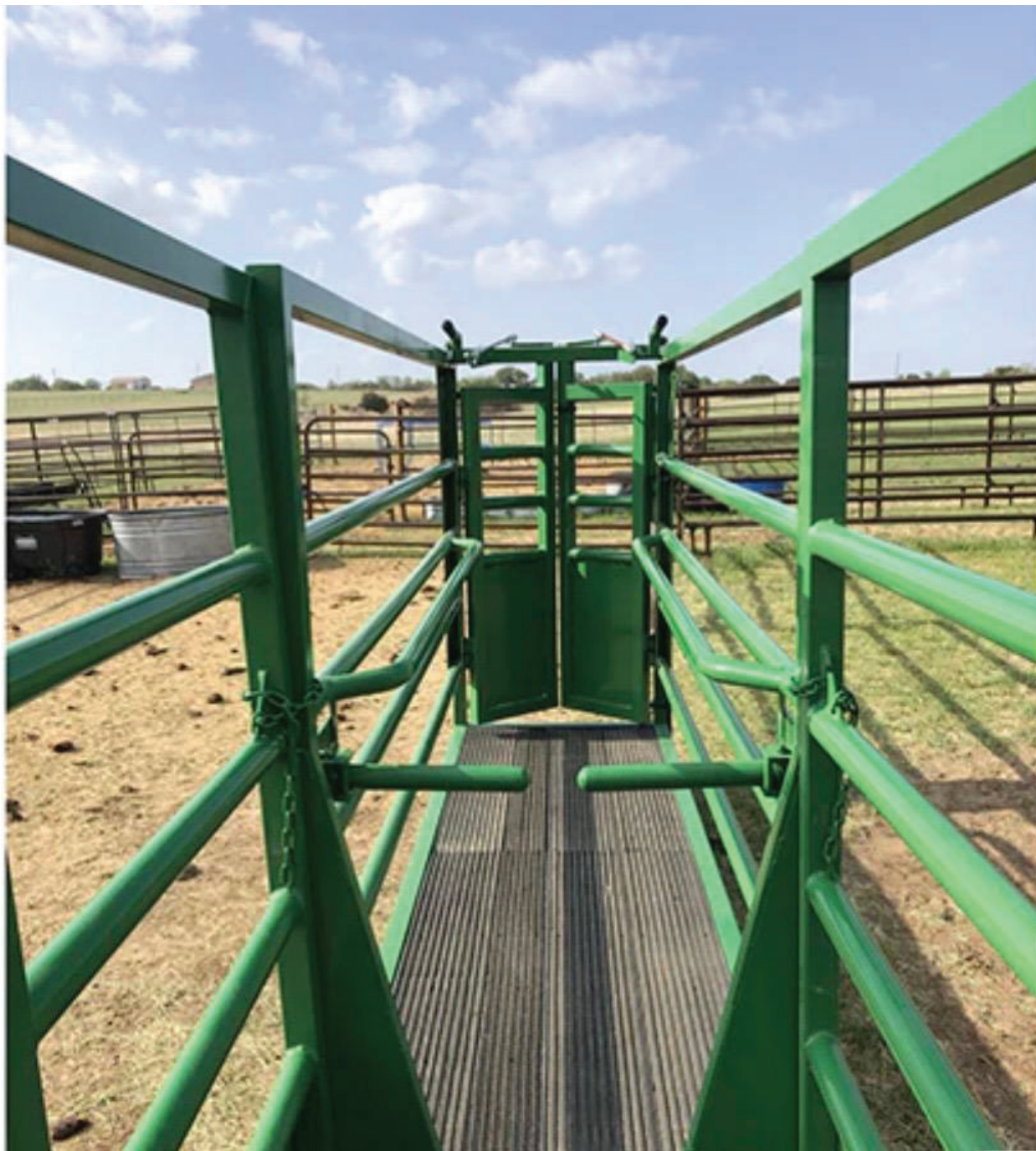
Striping Chute Inside View