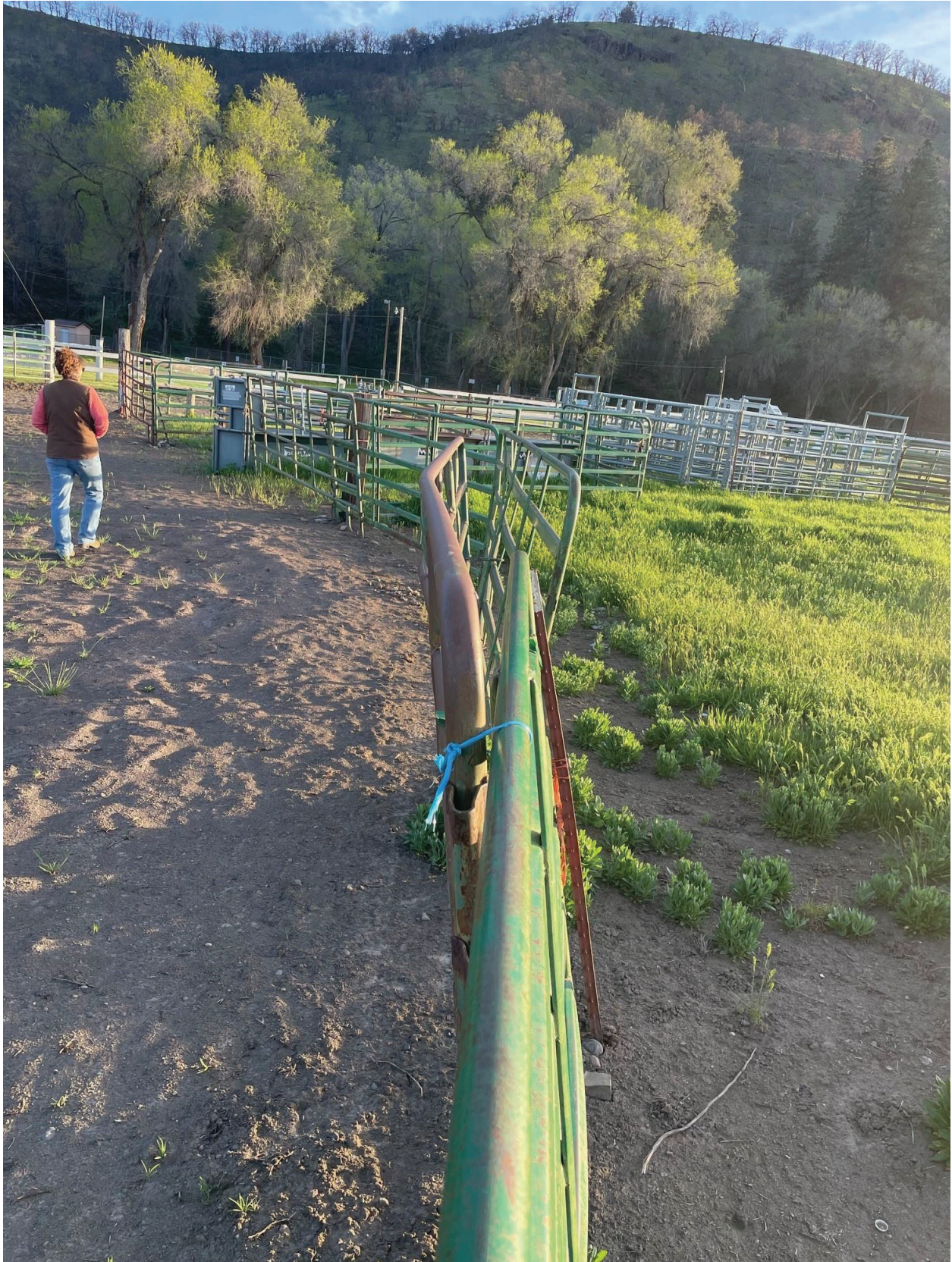
Fence panels not continuous.