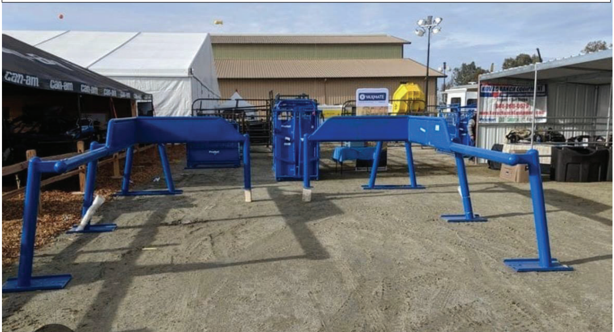
Rope Box 2