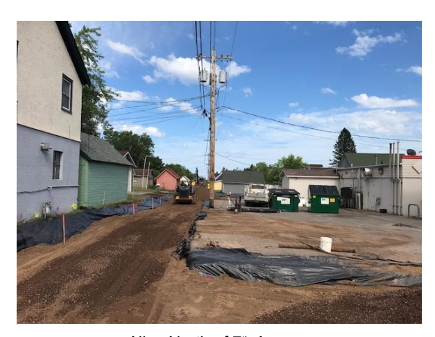
Alley North of 7th Avenue

Thank you to all the residents and other members of the public affected by the work this summer. Your cooperation and understanding during construction helps the project go more smoothly and is greatly appreciated!