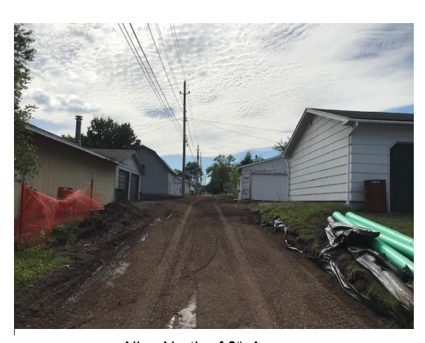
Alley North of 8th Avenue

Construction is underway on the 2019 Street and Alley Project! The contractor for the project is Utility Systems of America Inc. Construction began June 17<sup>th</sup>.