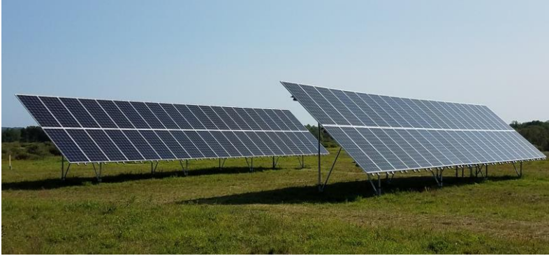
Detroit Lakes Public Utility's 29.3 kW Select Solar Community Solar Garden Detroit Lakes, MN