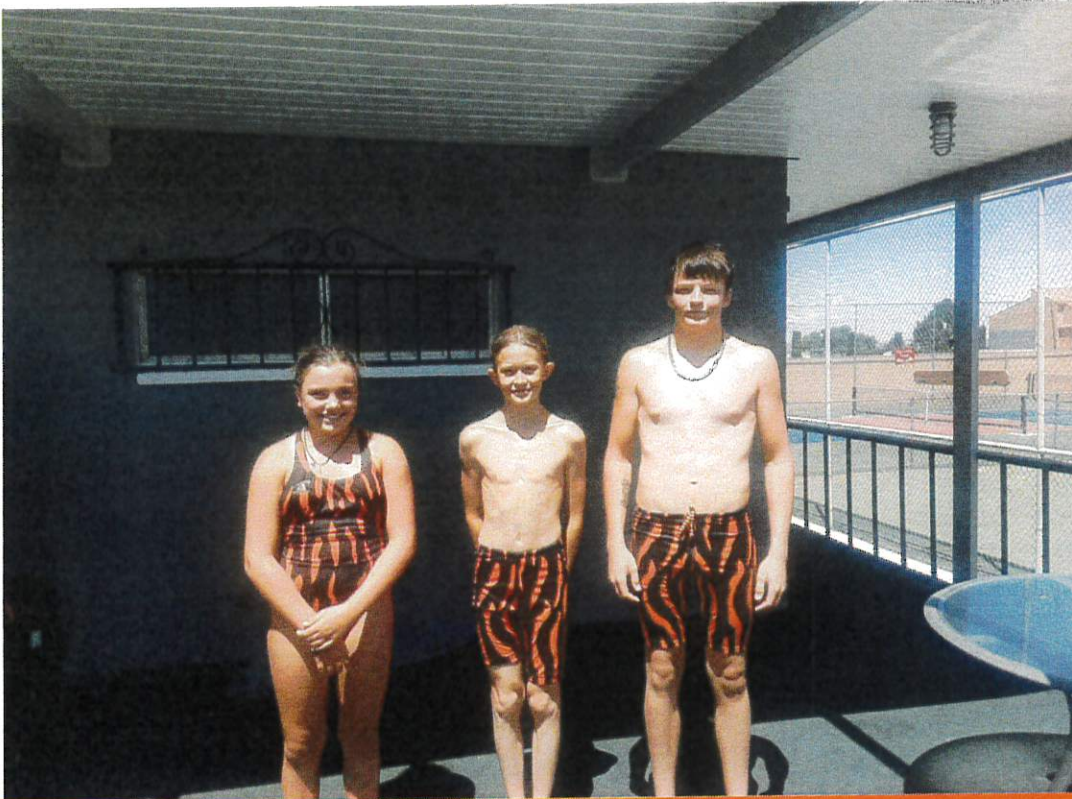
Above: Breaststroke Below: Butterfly