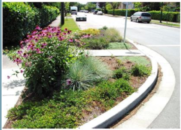
Proposed Traffic Calming Measure & Potential Stormwater Treatment