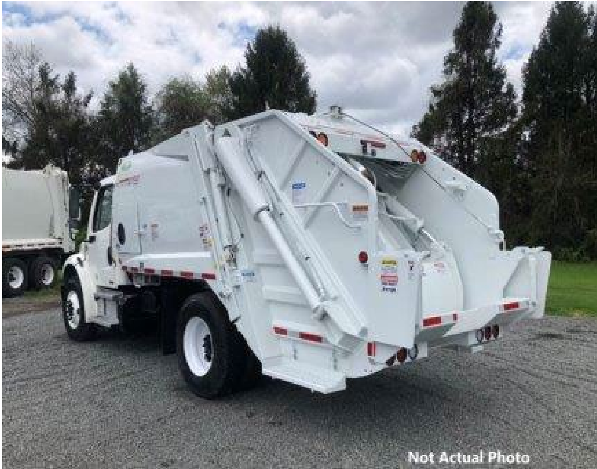
Loadmaster Legacy3 Rear Loader