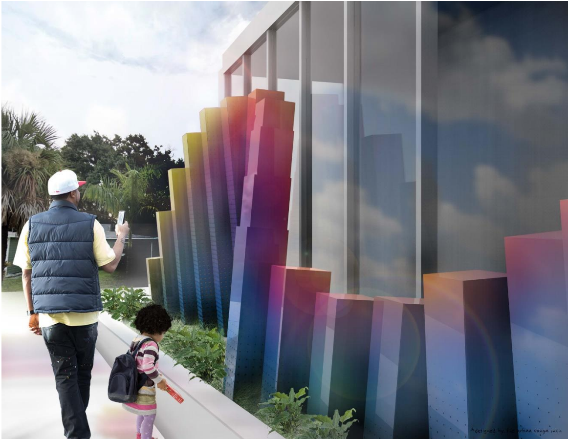
Exhibit A Final Design and Description of Artwork

Often, climate change is a challenging topic for people to want to hear or discuss. It is often talked about in a way that makes people feel uncomfortable or overwhelmed. With this project, The Urban Conga, Inc. creates an interactive platform for an open conversation around data drawn from the National Oceanic and Atmospheric Administration.