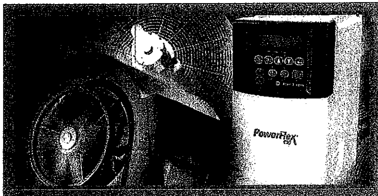
PowerFlex 400 AC Drive