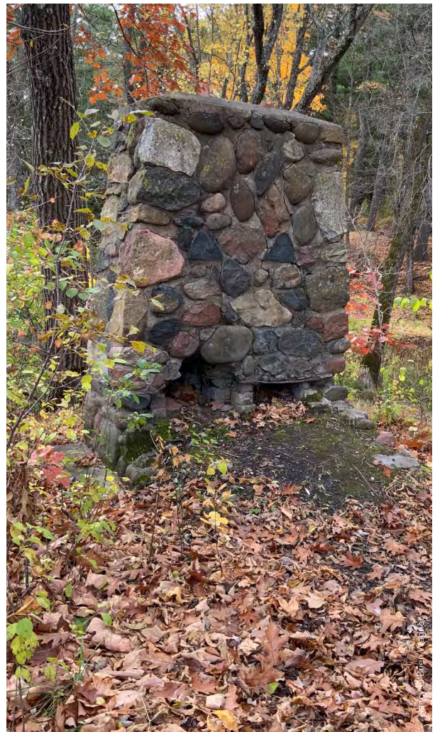
The original 1930s fireplace is still standing, though in need of repair

In the 2010s, local residents grew increasingly concerned about the state of the landing. The erosion and maintenance issues were significant, but the proposals for paving the landing were expensive. Local residents were also concerned about any improvements increasing traffic beyond the capacity of the space. In 2017, the city council voted to leave the landing road untouched. 56