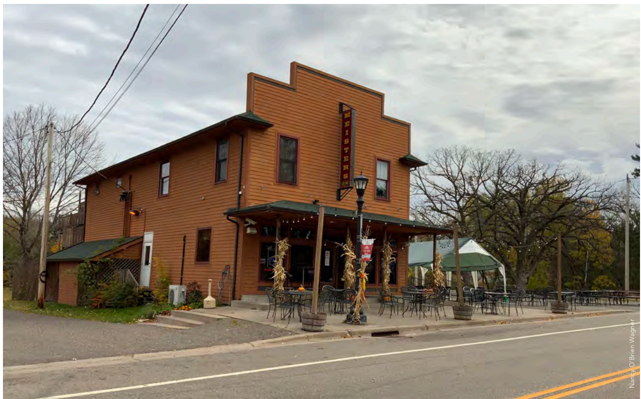
Meister's Bar and Grill is housed in a building that was moved in 1930 from in nearby Copas.