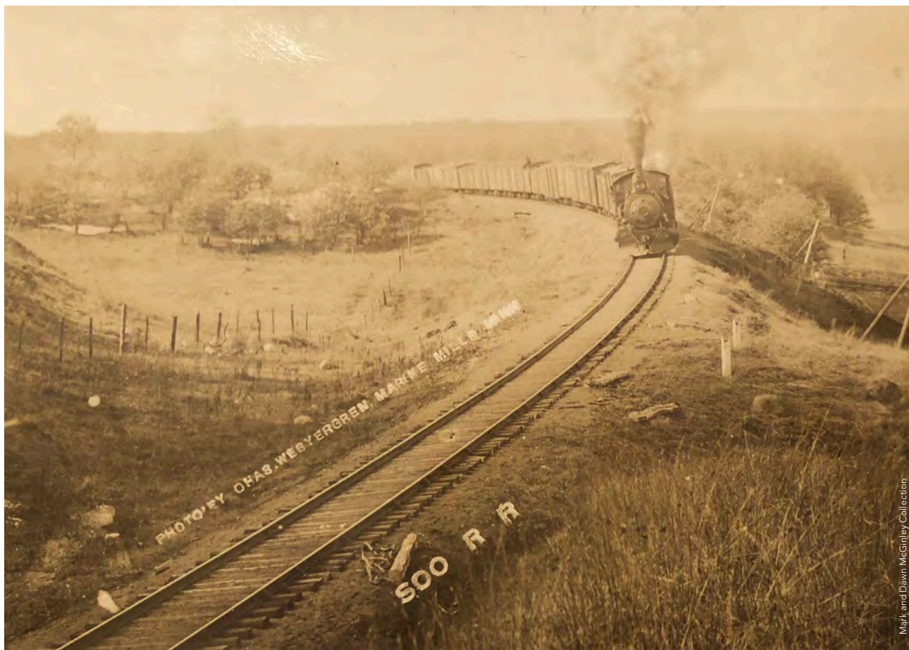
The arrival of the railroad brought commerce and success to places like Marine Mills and Copas, while its absence caused Scandia and Otisville to falter.

In 1887, the Minneapolis, Saulte Ste. Marie and Atlantic Railway expanded a railroad from Stillwater toward Osceola, Wisconsin. The railroad crossed the river near Cedar Bend, where a swing span was constructed to allow for river traffic. The bridge has been altered, and the swing span has been fixed in place. It now owned by the Canadian National Railway. 49