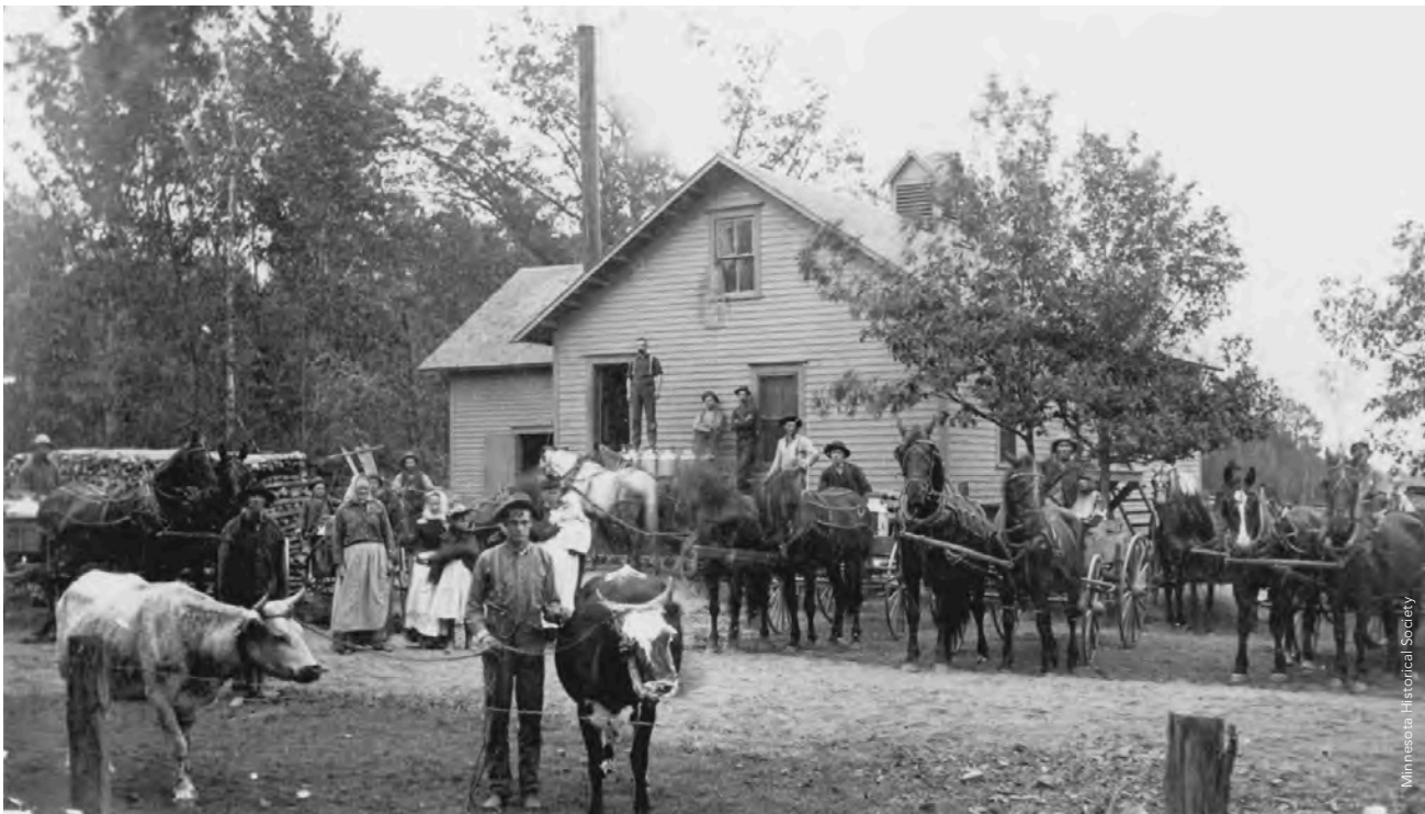
The Scandia Creamery was established in 1893, and a creamery building was built in 1894, the year this photo was taken. A second building was erected in 1913 and still stands.

By the 1950s, agricultural changes, food safety regulations and economic pressures were forcing dairy farmers to consolidate, expand, or close. The creamery remained open until 1960, and closed soon after. 33