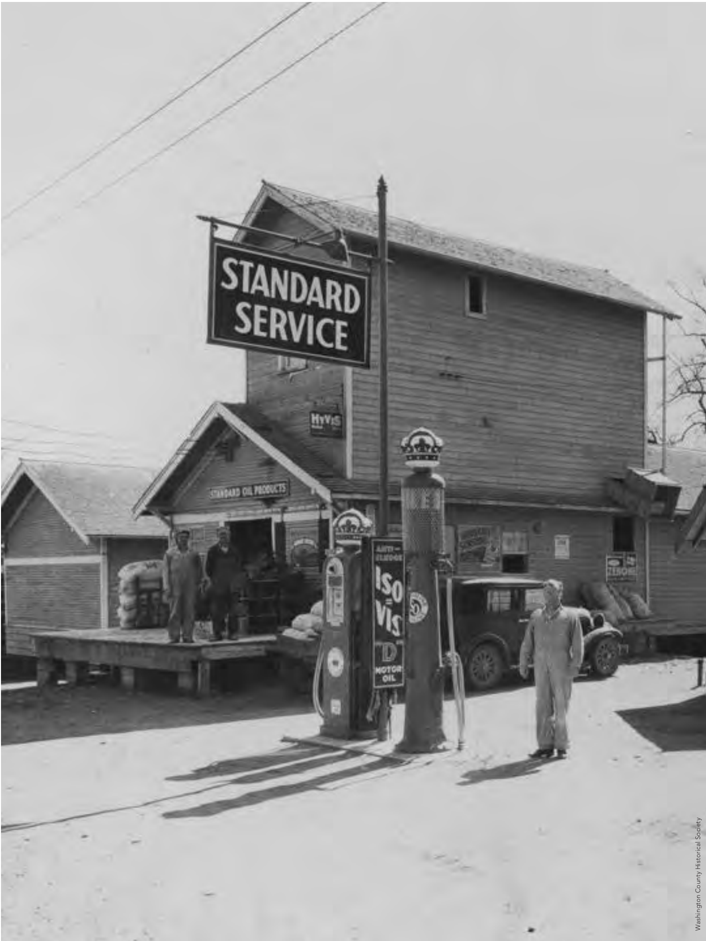
The feed mill and service station.