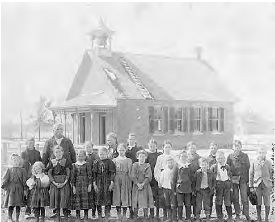
The Hay Lake school as it appeared in 1898! This school building served students from 1896 to 1963. Today it is owned and operated by the Washington County Historical Society.

Like many rural schoolhouses, Hay Lake School was a community center. In addition to serving as a school, the building was the setting for PTA meetings and social events. From 1963 to 1970, the school sat empty and boarded up. In 1970, local citizens, including many alumni of Hay Lake School, cleaned up the building and started giving tours. It was placed on the National Register of Historic Places on July 1, 1970. In 1974, the Washington County Historical Society began offering formal tours, and in 1978, the Society purchased the building from the Forest Lake School District. 45