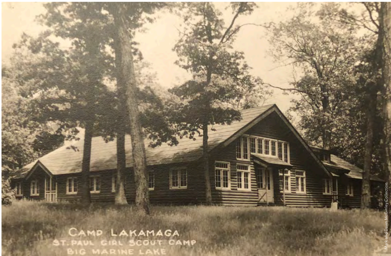
In the 1930s, the Girl Scouts developed a campsite on the shores of Big Marine Lake.

In 1926, local Boy Scouts started camping at the location of the old Rask Farm on the south side of Big Marine Lake. In 1930, the Girl Scouts purchased the land and began to develop the site. Early buildings included a Dining Hall and the Edgewood Infirmary. 71 For the first decade, the campers slept in tents. In the 1940s, platform tent sites were erected, greatly improving the experience. 72 The camp remains an active Girl Scout camp.