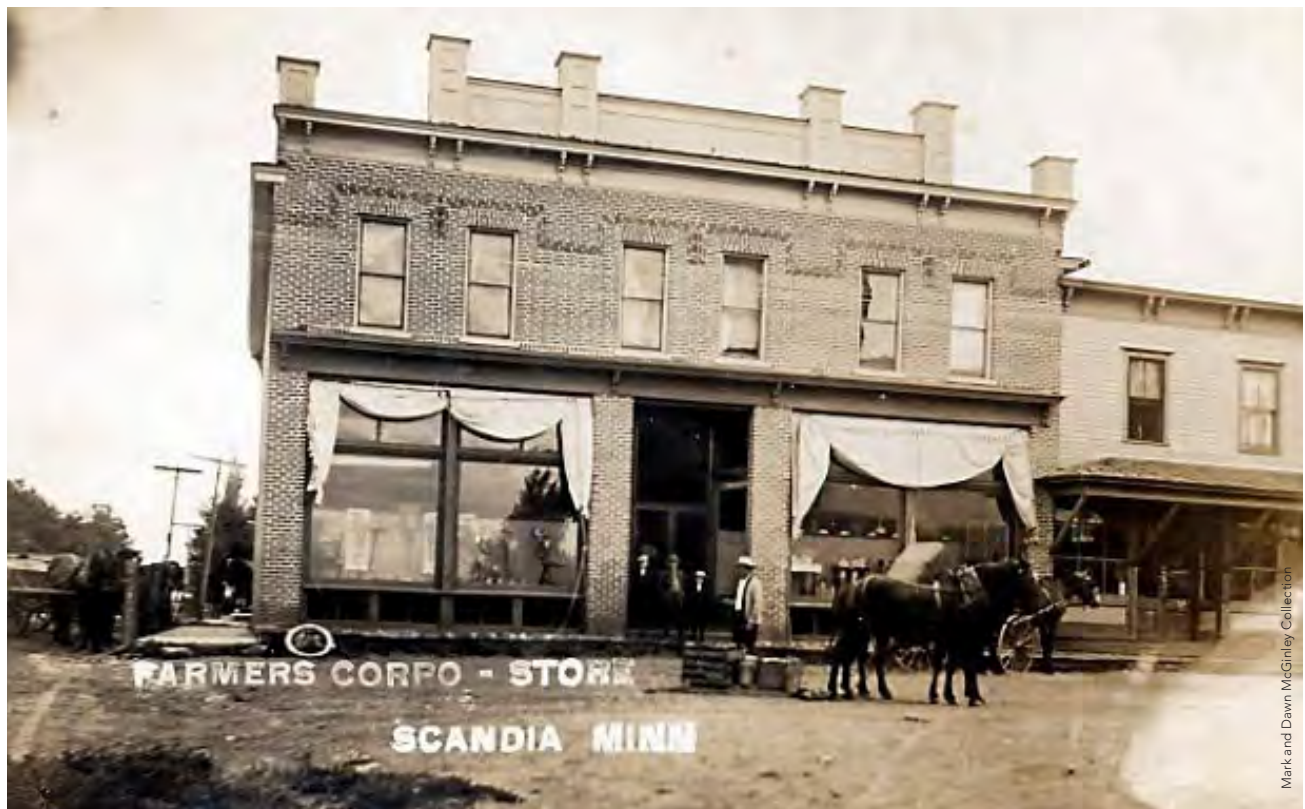
The Scandia Mercantile dates to 1879.