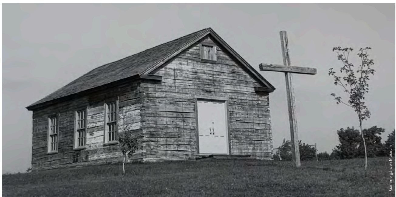
Scandia's first official church building was transferred to Gammelgården and restored. It is presently open to tours.

After that, the structure was moved to a nearby farm and used for hay storage. It was moved to the Gammelgården site in the 1970s and carefully restored in 1996. 17 The building is the oldest Lutheran church building in the state of Minnesota.