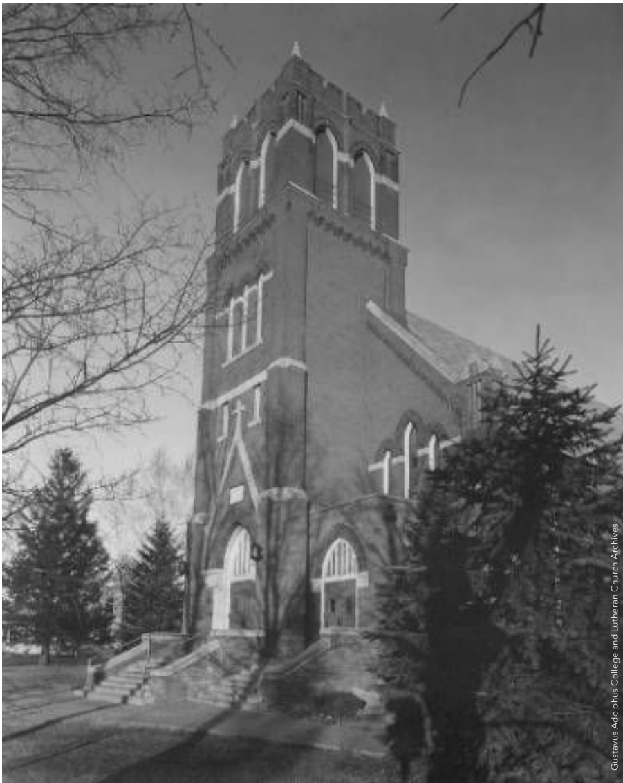
Elim Lutheran Church has weathered numerous disasters. The present building dates to 1930 and is the sixth church building.

In 1930, the church was rebuilt again. This newest church includes items salvaged from the previous church, including pews, the altar, the pulpit, and the statue of Christ. A Parish Hall was also constructed in 1930. An addition was built in 1965, which included classrooms, kitchen, and fellowship hall. Another 1999 addition added a new fellowship hall, classrooms, and preschool space. 18