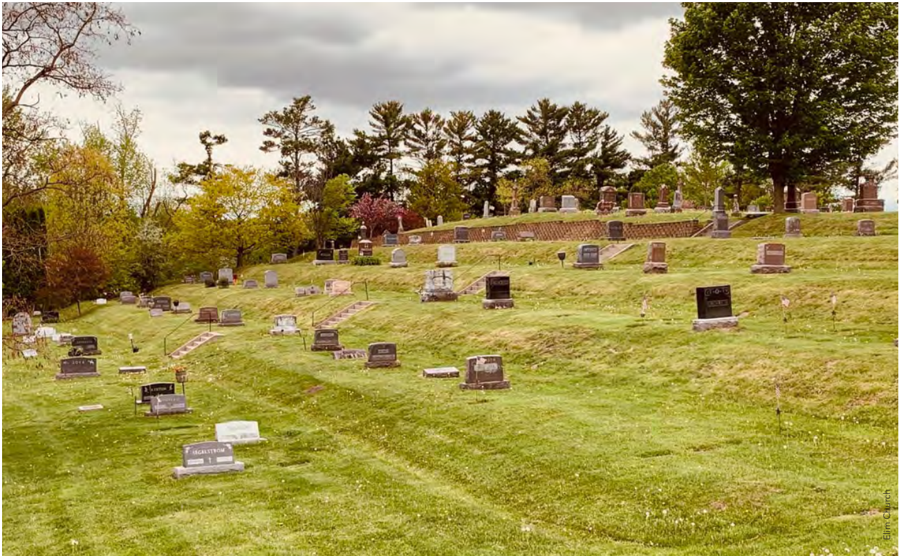
The Elim Cemetery was established in 1860.

Prior to the acquisition of this parcel of land in 1860, at least three cemeteries were used by the Elim congregation. One was on the west side of Sand Lake not far from the first church building. 23 The congregation currently manages two separate cemeteries. This northern, larger one has been in use since the early 1860s, and was the site of the second Elim church.