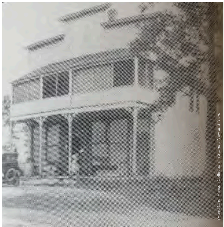
In 1920, the Kuno family lived in the second floor of the store.