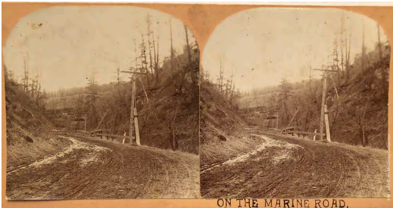
The Point Douglas to Superior Road was rough – but it served as a critical route for development in the Valley.

The quality of the road was poor, the road meandered to avoid large trees and swampy areas, and crossed over streams on narrow bridges. In the summer, the roads were dusty and bumpy. Stagecoach fares ranged from three to fifteen cents per mile and the coaches traveled between four and twelve miles per hour. Until 1934, when it received its first coat of blacktop, the road was entirely dirt or gravel. 68