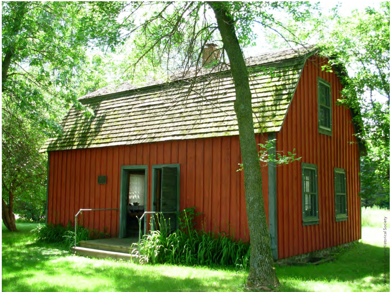
The Erickson Log House was built in 1868.