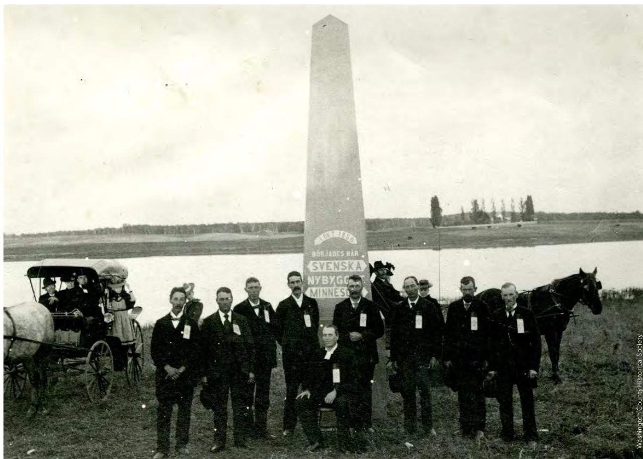
In 1902, a granite obelisk was erected to mark the location of the first Swedish settlement in Minnesota.