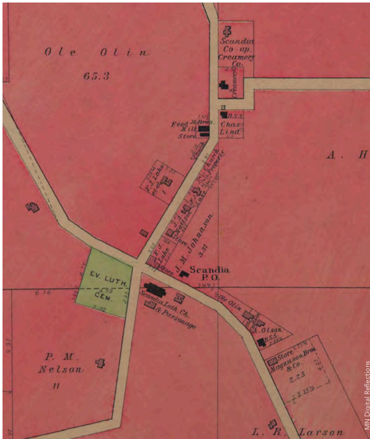
The 1901 plat map shows what buildings and businesses were in Scandia at that time.

Today, Scandia remains proud of its heritage of community activism. In 2007, the City of Scandia was incorporated. The Scandia Heritage Alliance was formed in 2016 to promote Scandia's history and heritage and draw visitors. The group hopes to connect the popular Gateway bicycle and hiking trail to the city's historic areas.