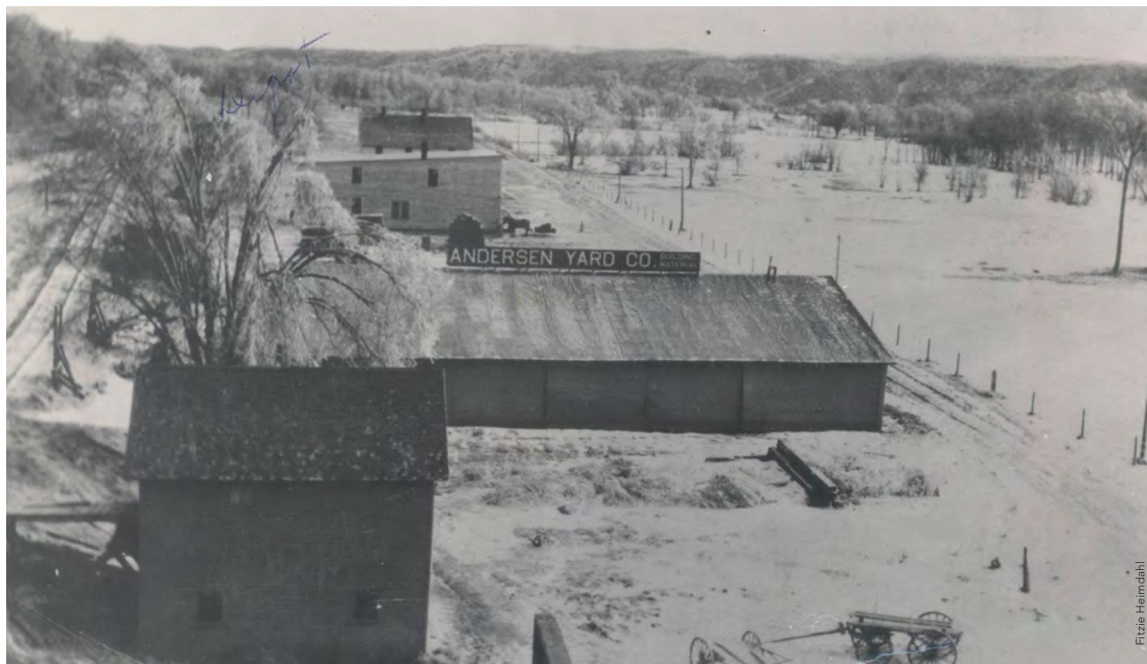
A small commercial strip developed alongside the Copas Depot. Note the railroad tracks on the left side of the photo.

By 1920, the population of Copas was estimated to be seventy-five. 66 Copas was an active railroad station through the 1930s. Once passenger service was cancelled, the town died. In 1963, the Copas Depot was removed.