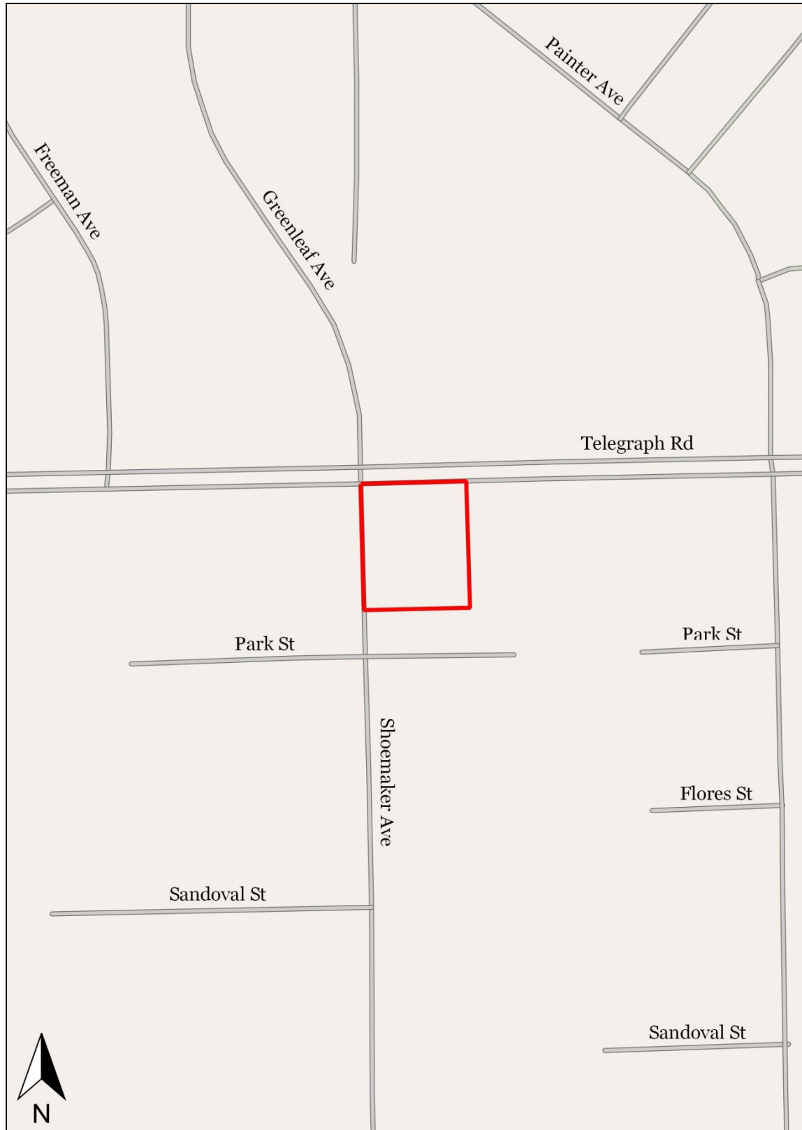
EXHIBIT 3 LOCAL MAP