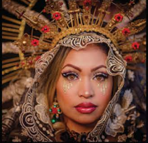
O.G. LADY KEY FEATURED ARTIST