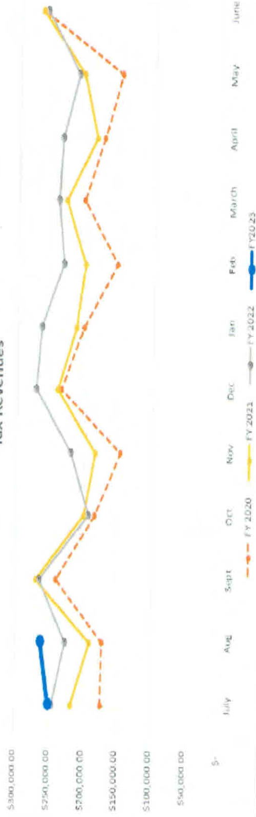
City of Salem, Combined Sales Tax Revenues