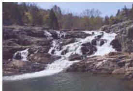
Rocky Falls just off Hwy 106

◆◆◆Side Trip to Rocky Falls, Powder Mill, Blue Spring, Klepzig Mill. Head east on to Hwy. 106 make a right on Hwy. H, head South to Hwy. NN, go 5 miles until you see the turn off for Rocky Falls Shut-In on your right. Klepzig Mill is a few miles further down Hwy. NN on the left. Return to Hwy. 106, going east. Powder Mill campground is on the right after crossing the River Bridge. The Blue Spring turn off is 2 miles east, turn off on the right. Blue Spring is the 9 th largest spring in Missouri.