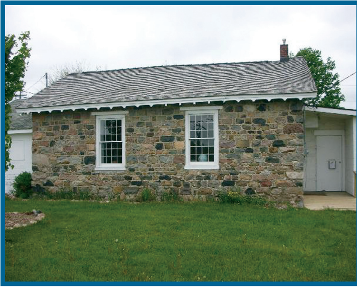
Jarvis (Salem) Stone School - Erected 1857

We have visited the early settlements of Salem including Brookville (Lapham's Corners), Worden (Pebble's Corners), Rider's (Walker) and Summit.