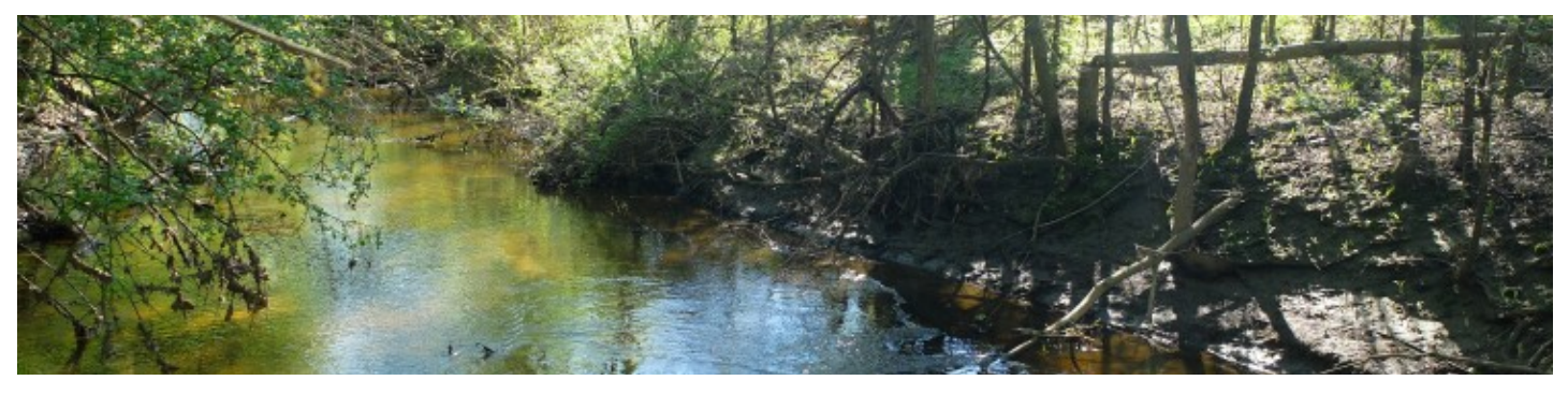
Figure 1 Johnson Creek, the highest quality tributary to the Rouge River, showing signs of bank erosion.