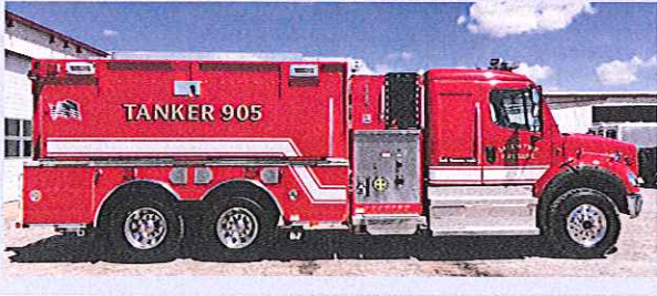
Tanker 905: Salem Township's new Tanker/Pumper.