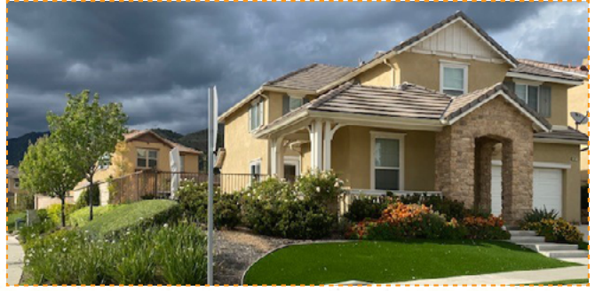
This home provides a good example of defensible space.

Preventing conditions where fire can travel from adjacent fuels, through an ornamental landscape to your structure, is the key to creating defensible space. Fire spreads through convection, conduction, radiation, or embers. Proper maintenance of ornamental vegetation reduces ember production, fire propagation, intensity, and duration of the approaching flames.