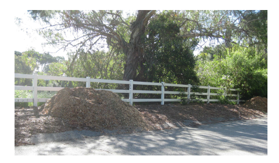
Spread chips to be no more than 4 inches deep.

Compost, mulch, or dispose offsite all vegetation materials cut during fuel treatments. Cut material may either be chipped and spread so the chips are no deeper than 6 inches. If cut materials are not chipped they must be hauled from the site.