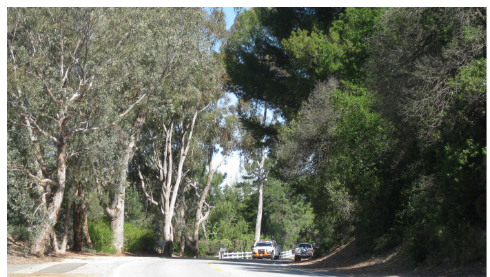
The row of trees on the left are more fire-safe than the ones on the right because of the arrangement of the lower branches and the density of the trees. The trees on the left have most lower branches removed, and the density of the vegetation is less.

When these trees are used for privacy, match the tree size with the item to be screened so they do not unnecessarily block views. Crown thinning is advisable for fire safety only when there is an avenue for fire to reach the tree crown. Shrubs and short trees serve better as screening material than larger trees