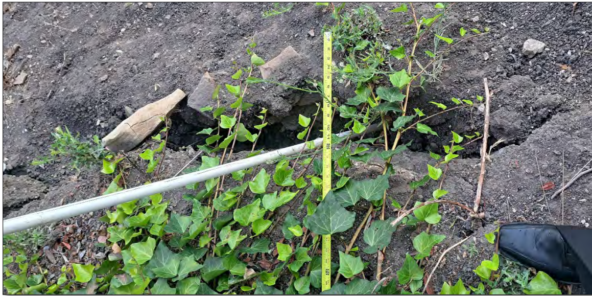
Figure 1: Crack between 3 and 5 Quail Ridge Rd. S.

and earth movement on Quail Ridge Road South. This is a step in the right direction and we applaud the efforts by the Community Association. However, the City needs to account for all activities which may contribute to the instability of the land. A multi-faceted approach is necessary. Development, demolition, grading, excavating, tree removal, and other infrastructure projects need to be reviewed with respect to their effect on land movement.