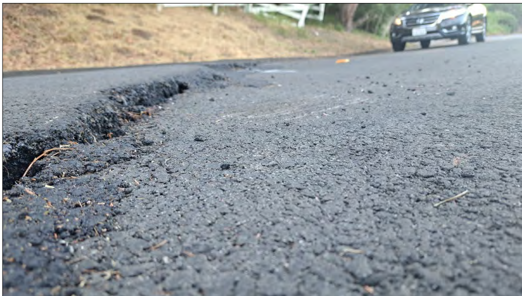
Figure 2: Crack and movement on Quail Ridge Rd. S.