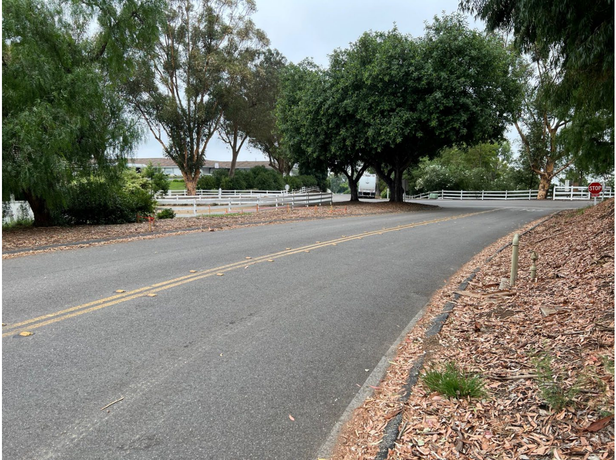
TOP: View from Southfield looking toward intersection. BOTTOM: Same view but from centerline.