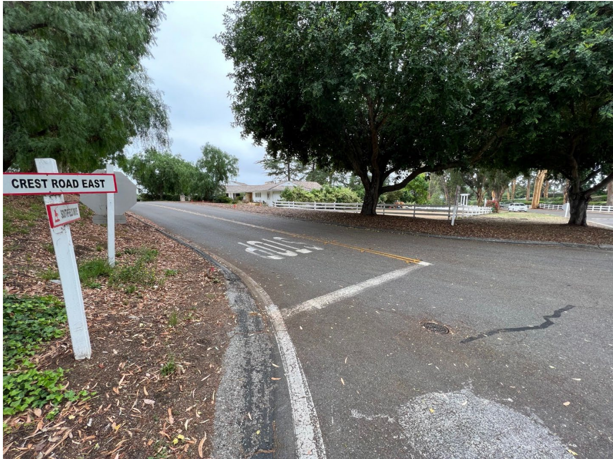
TOP: View from intersection looking toward proposed driveway. BOTTOM: Same side of the street.