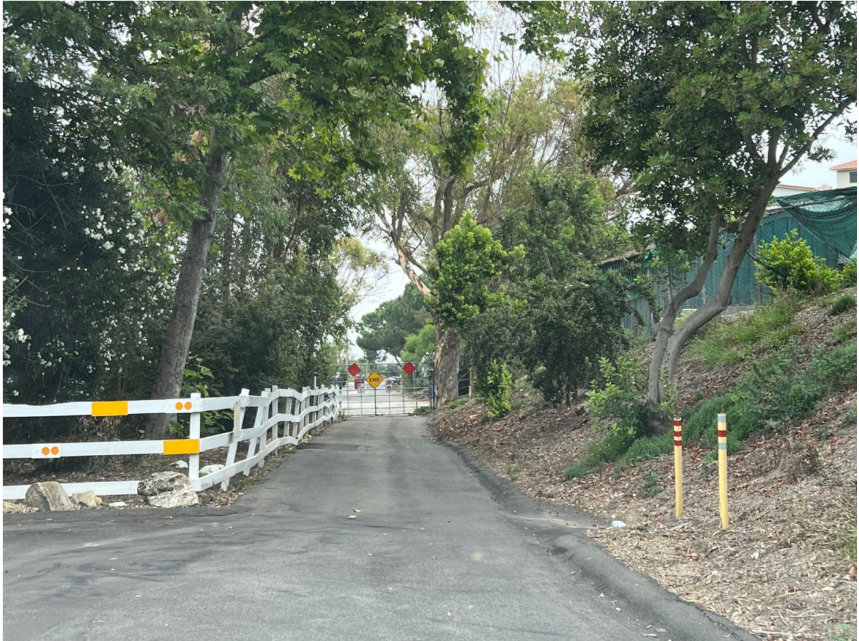
TOP: Looking east toward locked gate. BOTTOM: Looking west in opposite direction.