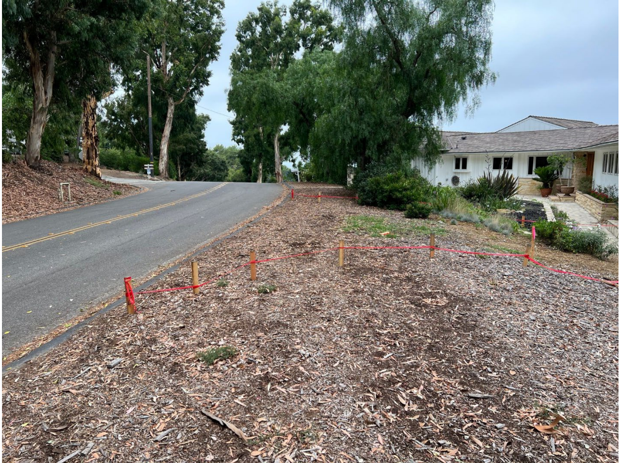
TOP: View next to proposed driveway. BOTTOM: View from intersection.