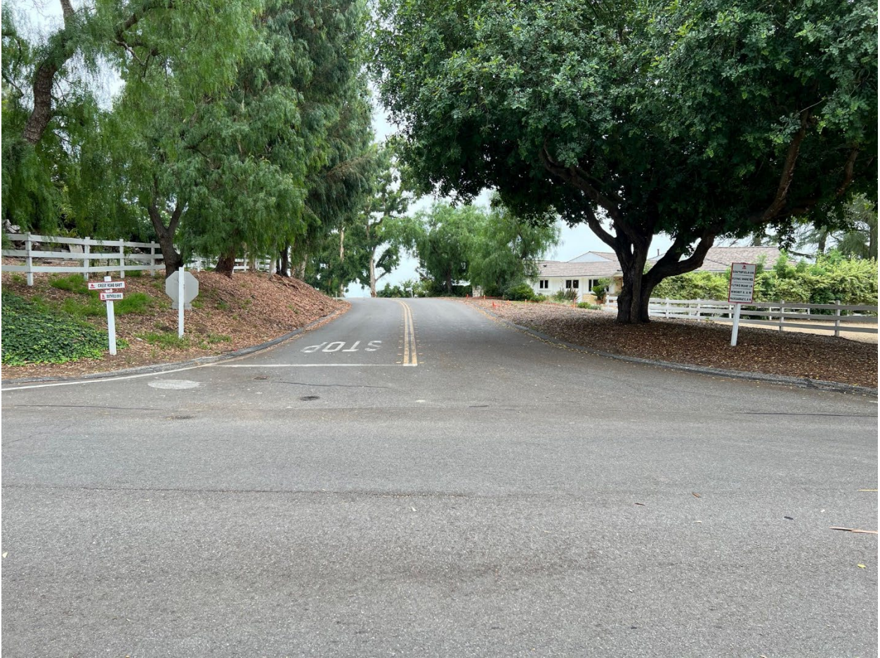
TOP: View from center of intersection. BOTTOM: View from across street.