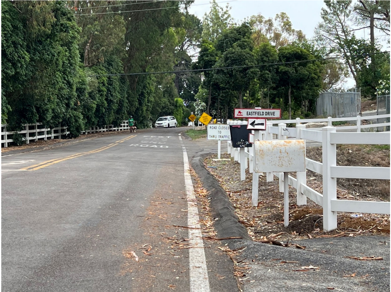
TOP: From intersection of Crest Rd. E. & Eastfield Dr. BOTTOM: View of signs.