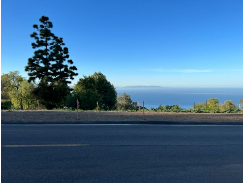
Looking south toward secondary driveway entrance