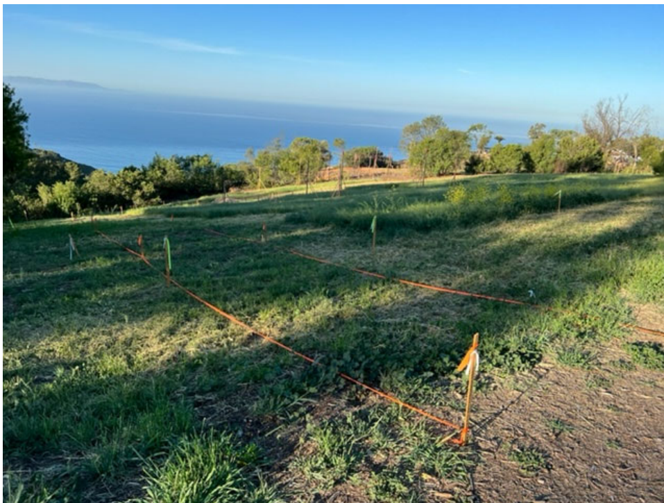
Secondary driveway location with stable in background