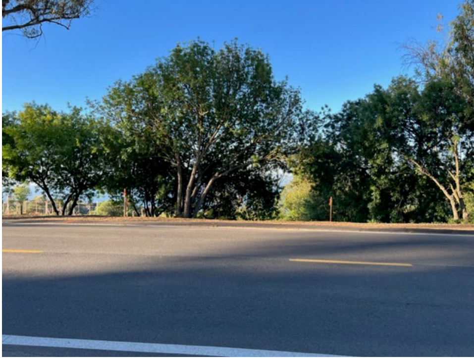
Looking south toward main driveway