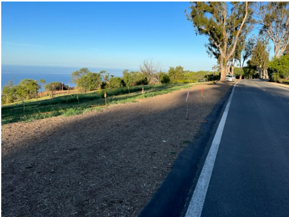
Looking northwest along Crest Road East