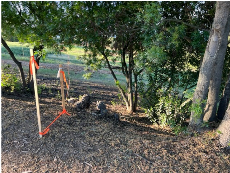
Looking south along edge of main driveway