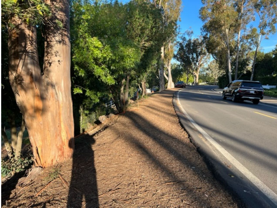
Looking northwest along Crest Road East