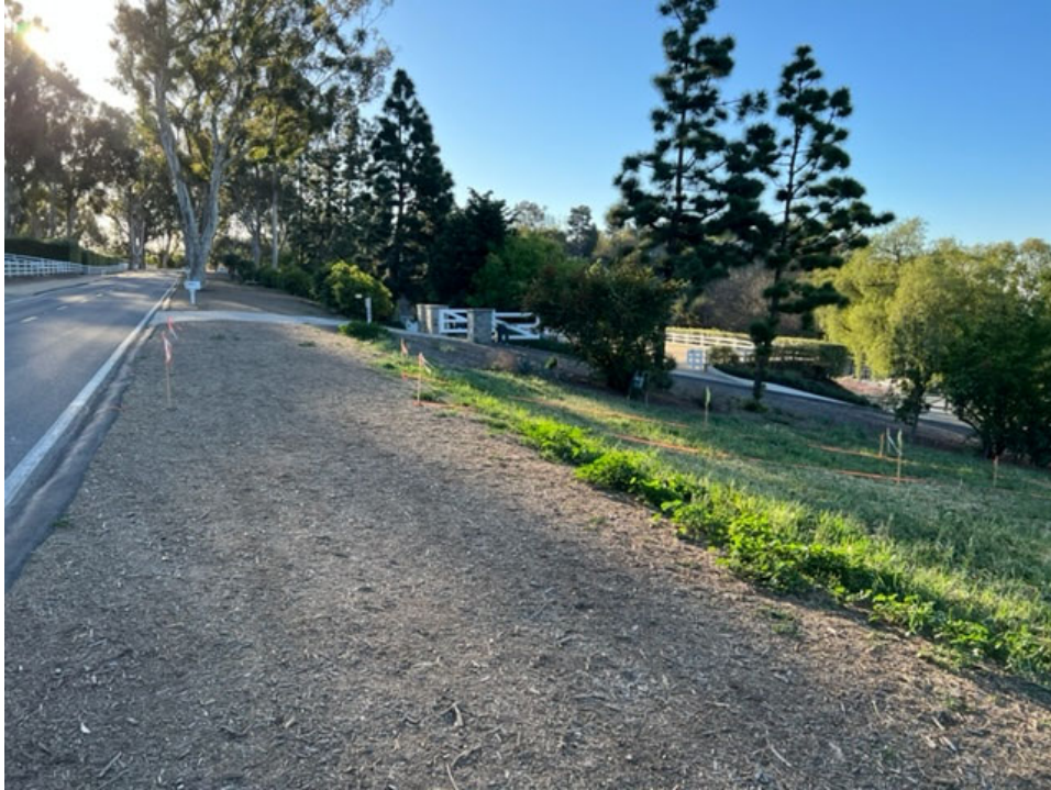
Looking southeast along Crest Road East