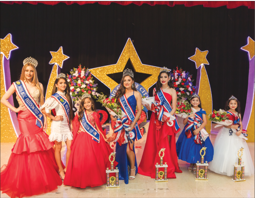
MISS FREEDOM FEST COURT 2022 - The City of Rio Grande City thanks the entire 2022 Miss Fest Court for the year of service and dedication to our community.