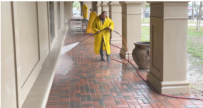
The Parks and Recreation Department took some time to help improve the look of city hall by power washing the exterior of the building on Wednesday, November 2nd!