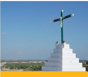
LA SANTA CRUZ (Behind) 5381 US-83, Rio Grande City, TX 78582