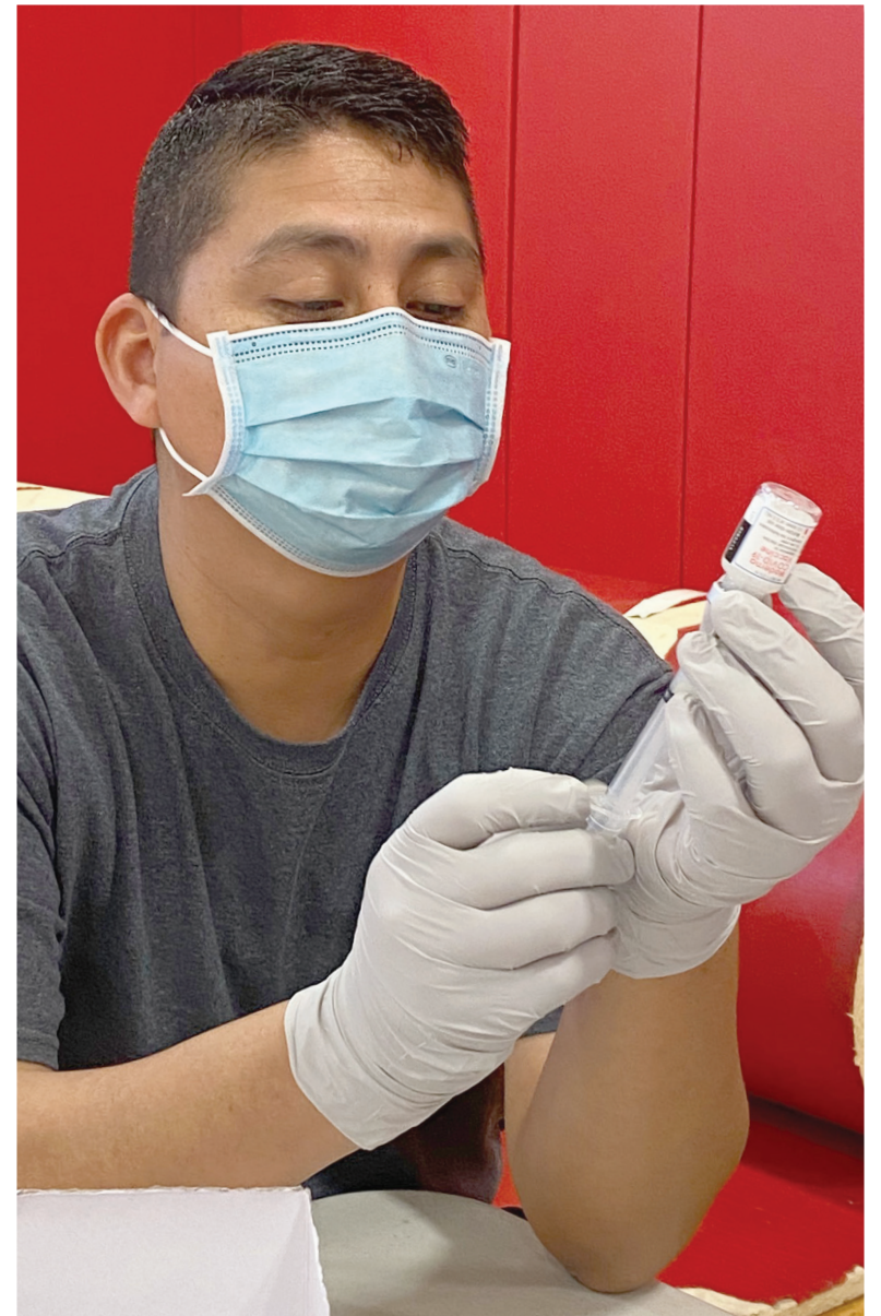
The Rio Grande City Fire Dept. reminds residents August is National Immunization Awareness Month

There are many debates around the safety of many of the vaccinations available, however governments across the world, acting upon the advice of leading scientists and medical professionals overwhelmingly support immunization schemes. Despite this, the growing voice of the anti immunization supporters ( and some other factors) has lead to a decrease in the number of people becoming vaccinated and there is little surprise that the number of people affected by diseases that in some cases had been eliminated from some countries is on the rise again.