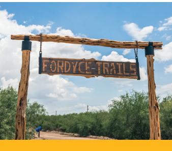
FORDYCE NATURE TRAILS 1496, US-83, Rio Grande City, TX 78582