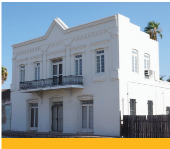
HISTORIC MAIN ST. 101 S Washington St, Rio Grande City, TX 78582