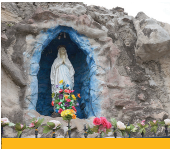
OUR LADY OF LOURDES GROTTO 101 E Canales Bros. St, Rio Grande City, TX 78582