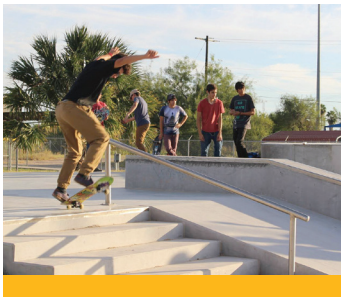
RGC SKATE PLAZA 1473 Stephen, Saenz St, Rio Grande City, TX 78582