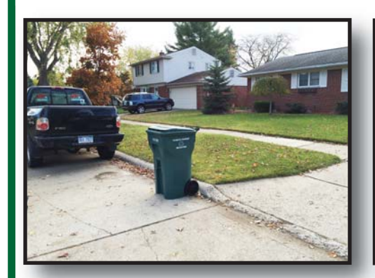
IN THE ROADWAY Place next to the curb or edge of your lawn area.