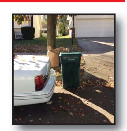
BEHIND A PARKED CAR