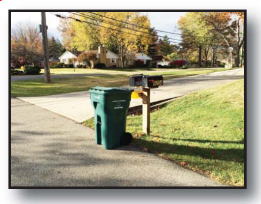
IN FRONT OF MAILBOX