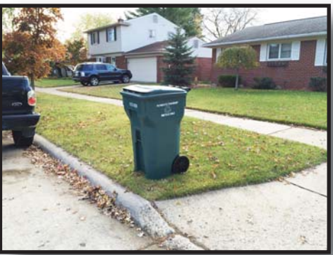
ON YOUR LAWN AREA Be mindful to keep cart within 4 feet of the roadway.