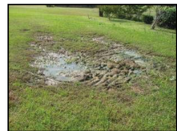
Improperly Draining Septic Field