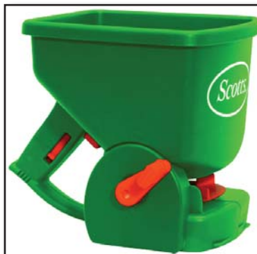
Example of a Broadcast Spreader