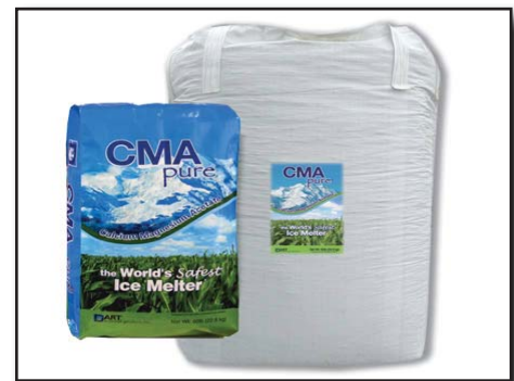
Calcium Magnesium Acetate (CMA) Rock Salt Alternative