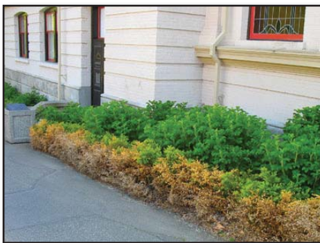
Damage to Shrubs Caused by Rock Salt

* Information obtained from www.semco.org