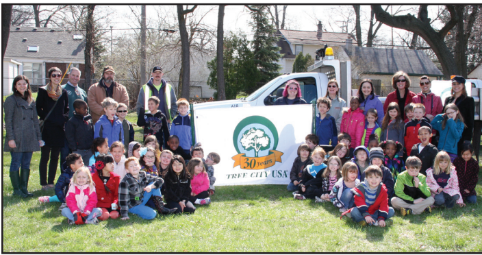
JFK Elementary first-graders, teachers, parents &amp; DPW staff