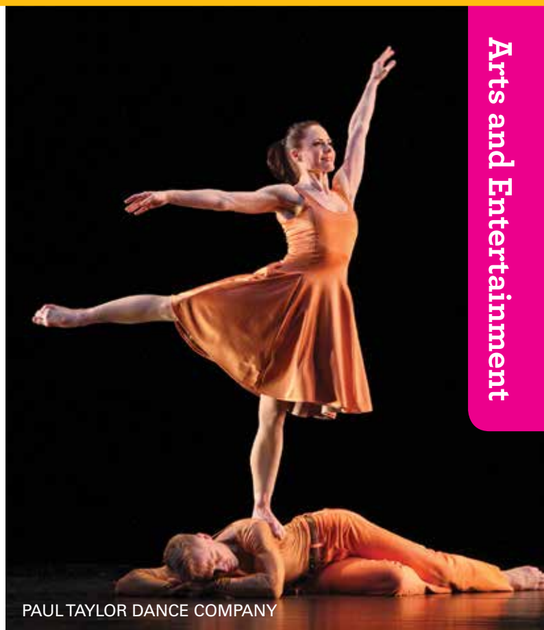
PAUL TAYLOR DANCE COMPANY

And, there's more to come. Visit the literature racks in the Recreation Department for these and more up-and-coming tours and day trips.