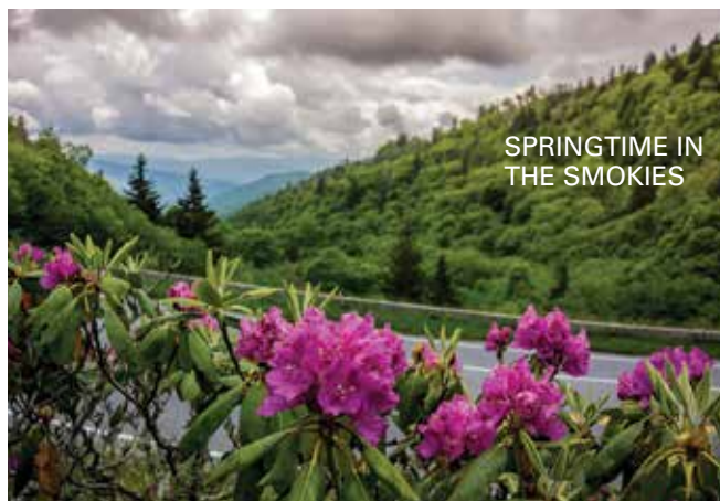
SPRINGTIME IN THE SMOKIES