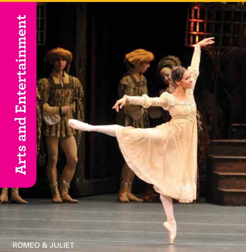
ROMEO &amp; JULIET