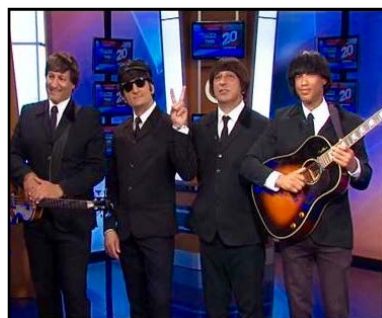
Toppermost Beatles Tribute

If you are a performing artist interested in booking an open date, call (248) 691-7404 or send email to kmarrone@ci.oak-park.mi.us .