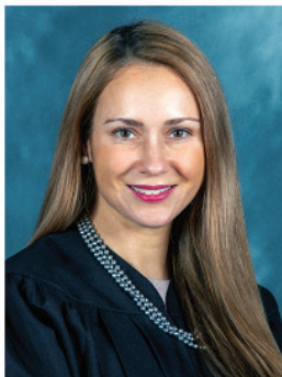
Jamie Powell-Horowitz, 45th District Court Judge