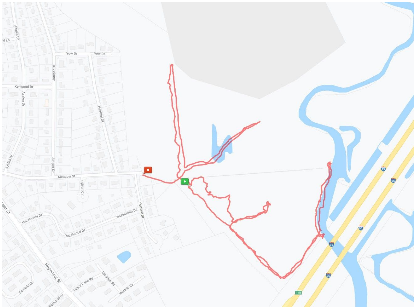
Meadow trail Track 2020-09-19.JPEG