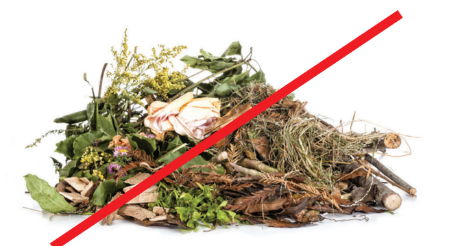
Leaves & Yard Waste