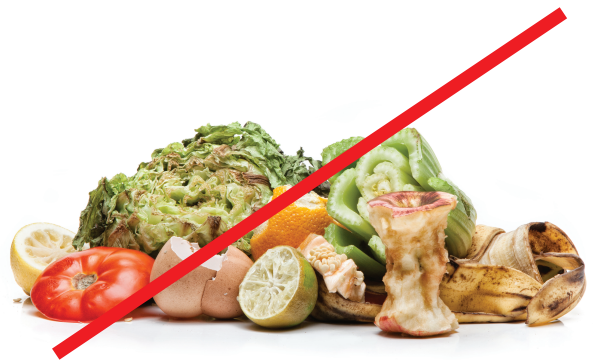
Commercial Food Waste (Food waste generators of 1 ton/week or more)

Massachusetts Department of Environmental Protection regulation 310CMR 19.017 has banned the following items for disposal at landfills and combustion (except wood) facilities. Additionally, these items are banned for transfer for disposal from transfer stations and construction and demolition facilities. These items must be handled separately.