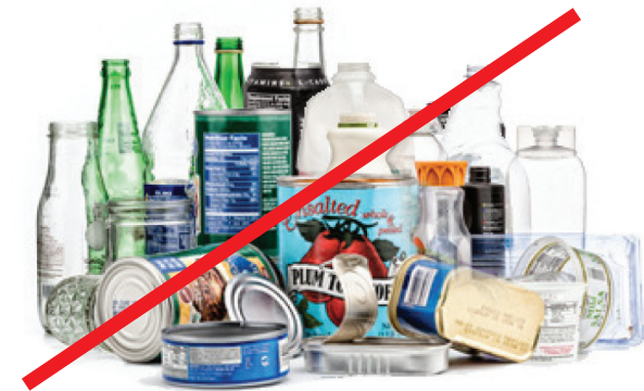
Glass, Metal & Plastic Containers