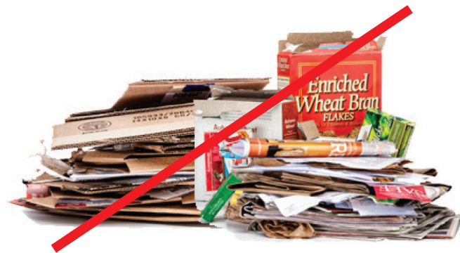
Cardboard & Paper