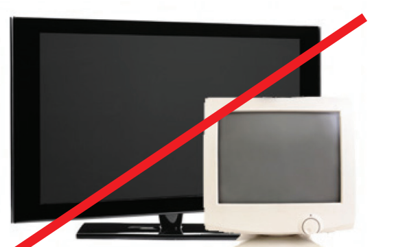
TVs, Computer Monitors & CRTs

ALSO BANNED: clean gypsum wallboard, vehicle tires, major appliances, (i.e., refrigerators, washers/dryers, freezers, a/c, ovens, microwaves, hot water heaters, etc.)