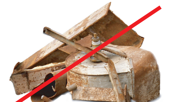
Ferrous & Non-Ferrous Metals