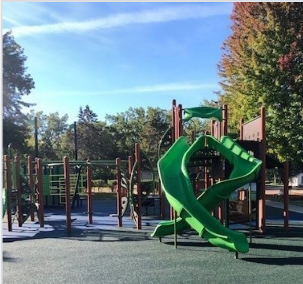
New Playground at Pioneer Park

New City Hall/Public Service Building Opens. We celebrated our Grand Opening on November 16th with large attendance at our ribbon cutting and open house. This building addresses safety concerns, space needs, ADA compliance issues, and maintenance efficiencies. It will play a central role in attracting businesses and developers to invest in Newport.