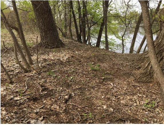
Selective vegetation removal is the removal of only isolated individual trees and shrubs that do not substantially reduce the tree canopy or understory.