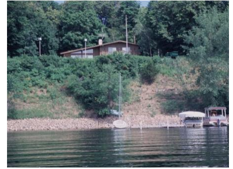
3. Steep slopes and bluffs visible from the river with no natural vegetation, degraded vegetation, or planted with turf grass.

If any of these restoration priority areas exist, then they will be the focus of the restoration plan. If none of these areas exist, applicants must propose other opportunity areas that could benefit from restoration. For ideas of other areas to restore, consult local zoning staff and the restoration priorities map in the ( insert city or town name ) MRCCA plan.