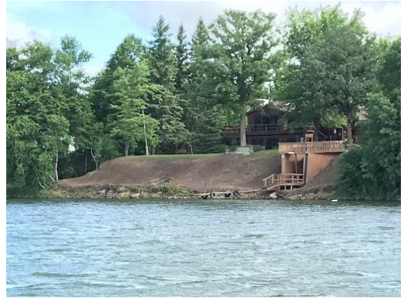
Intensive vegetation clearing is the removal of all or a majority of the trees or shrubs in a contiguous patch, strip, row, or block.