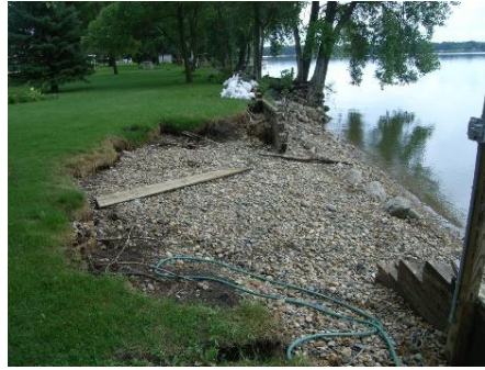
2. Shoreline areas with no natural vegetation, degraded vegetation, or planted with turf grass.