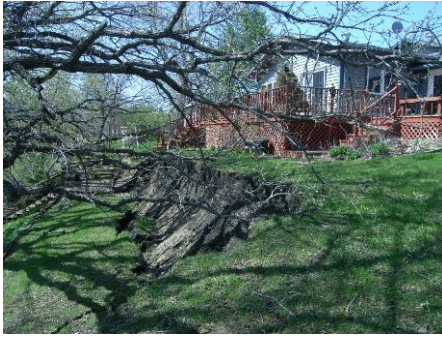
1. Areas with soils showing signs of erosion, especially on or near the top and bottom of steep slopes and bluffs.