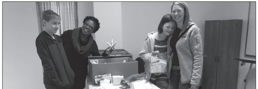
Activities pictured above are from January 2020.