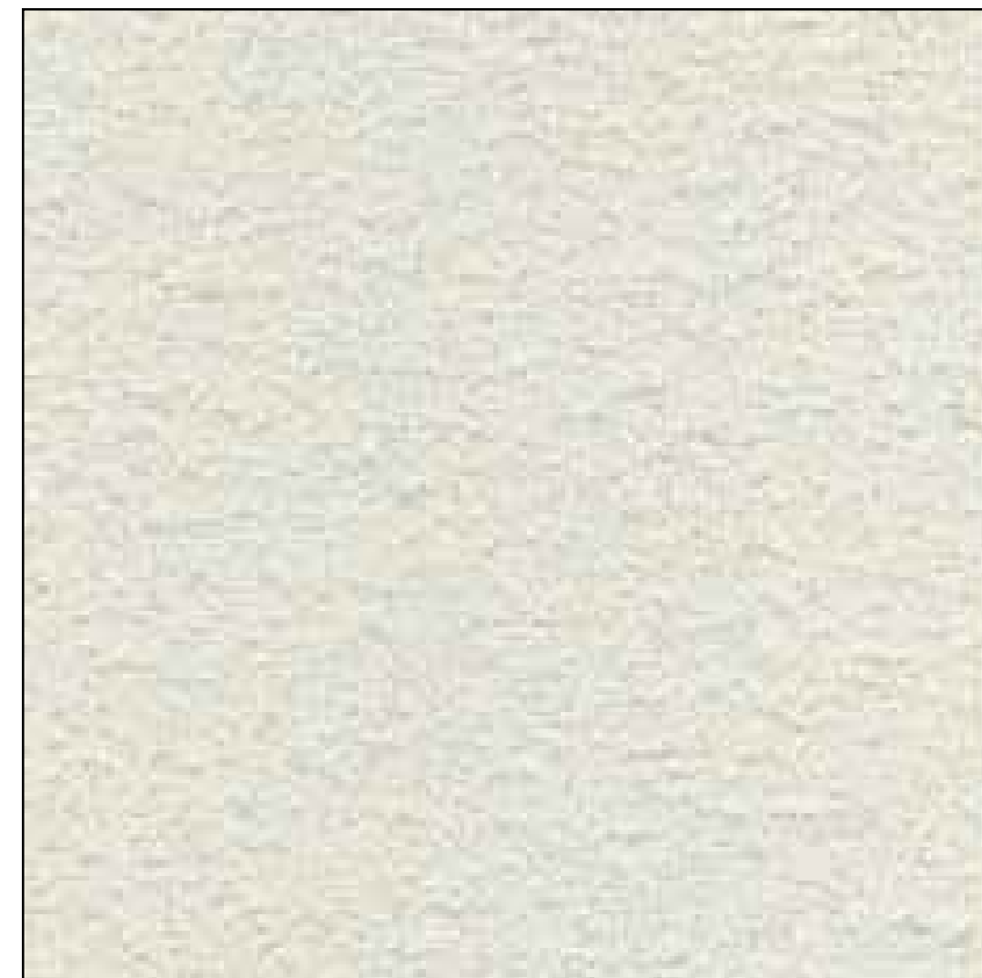
S 1 SENERGY STUCCO: CLASSIC STARK WHITE