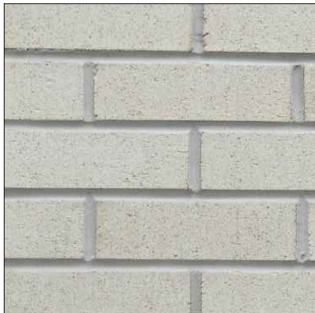
B 2 TAYLOR CLAY PRODUCTS FACE BRICK: WIRE CUT PEARL GRAY