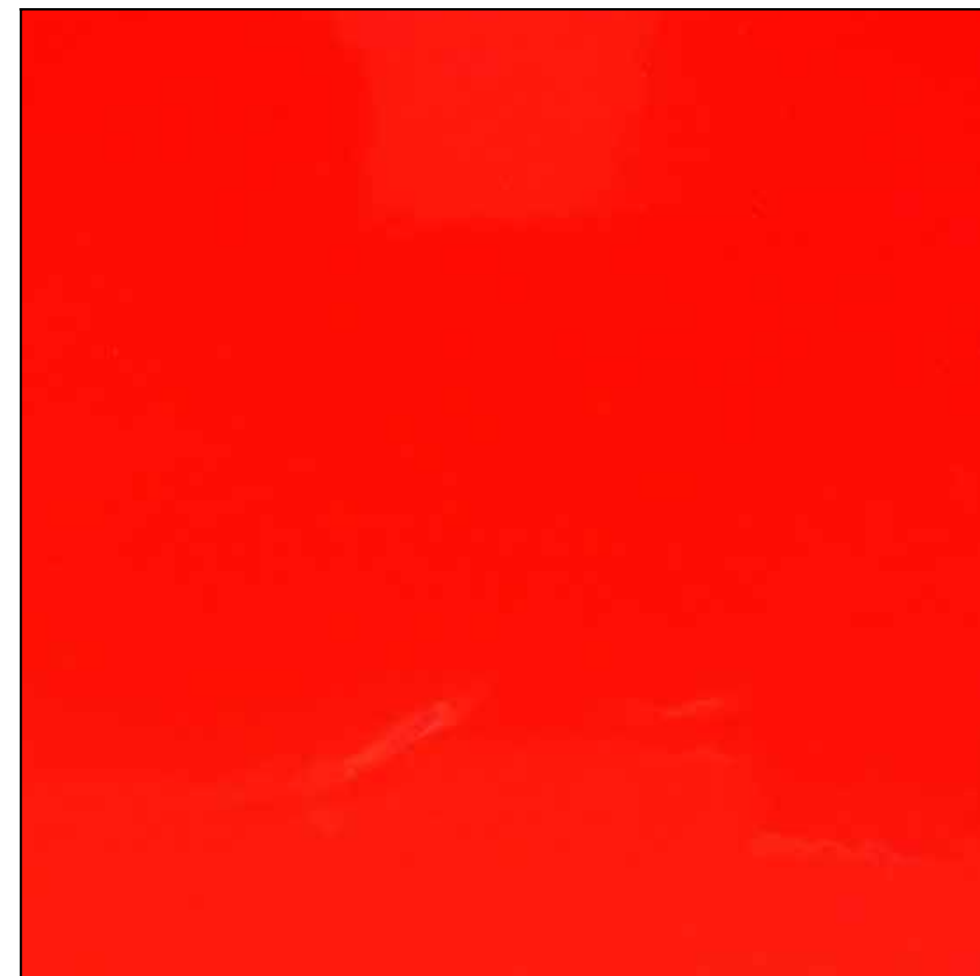
C 1 AWNEX CANOPY RED