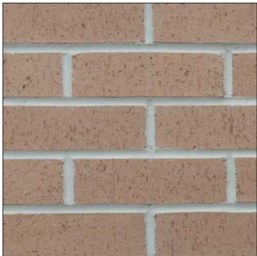
B 1 TAYLOR CLAY PRODUCTS FACE BRICK: WIRE CUT COPPERTONE