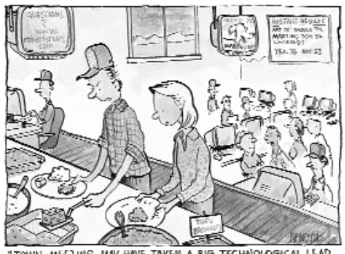
"TOWN MEETING MAY HAVE TAKEN A BIG TECHNOLOGICAL LEAP, BUT THE MARSHMALLOW JELLO HASN'T."

k) After the vote is announced, the moderator moves to the next article on the agenda by reading it to the assembly. If a voter interrupts this reading by moving to reconsider the prior vote, the moderator must stop his reading and ask if there is a second to the motion to reconsider. The meeting may only reconsider a vote once before going to the next item on the agenda.