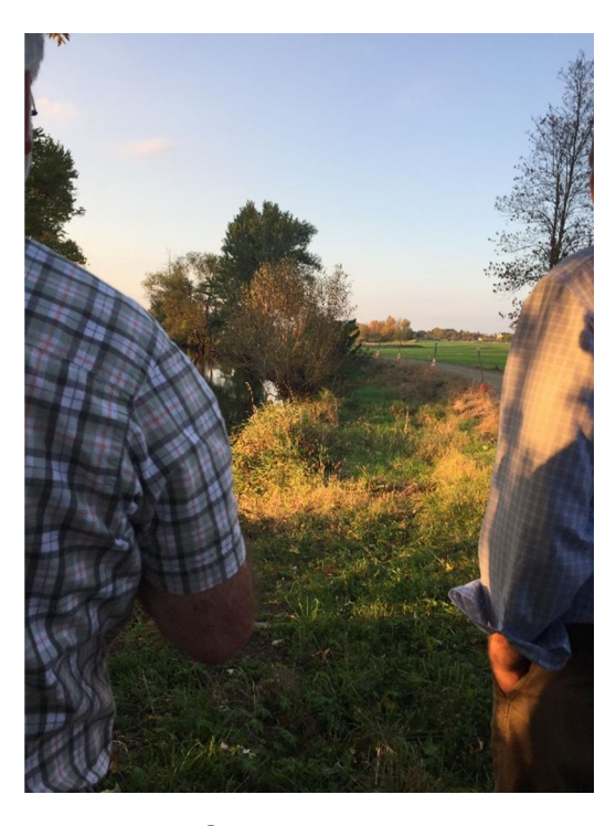
Fourth Stop – Near Perrin's Bank dropped 4-5'; 150' feet long