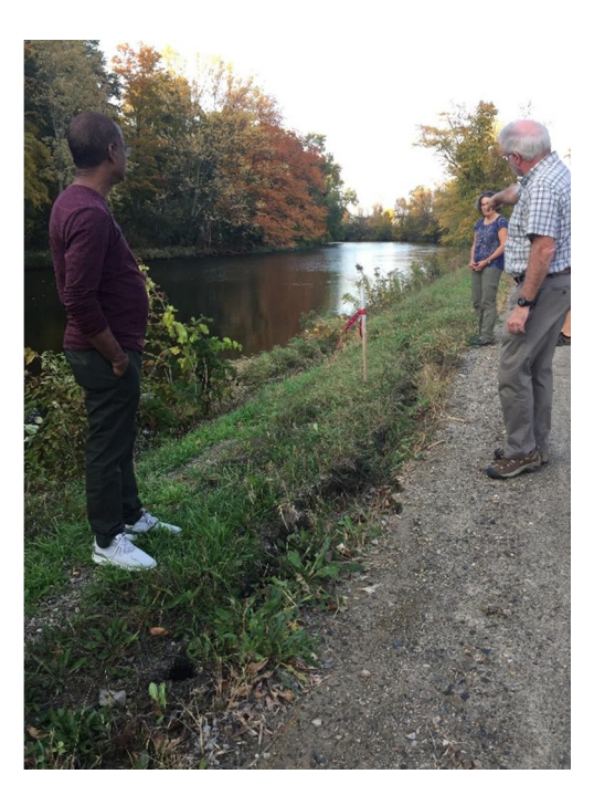
Second Stop - Opposite Bingham's Driveway New Section of Erosion