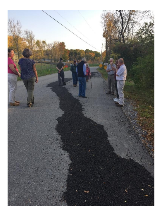
First Stop - Paved Section - Just south of ACTR Facility

The group met at the Recreation Center on Creek Road and traveled Creek Road by ACTR bus from the north to the south, stopping at six points along the way.