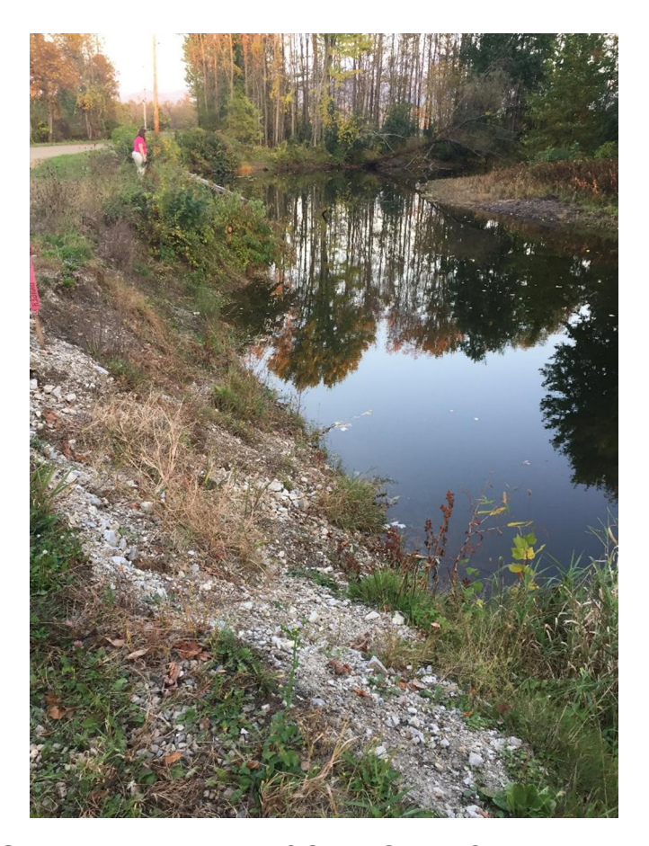
Sixth Stop – Intersection of Otter Creek & Middlebury River Erosion recently

The tour ended at approximately 6:15 p.m. and the Board travelled back to the Town Offices for its regularly scheduled meeting.