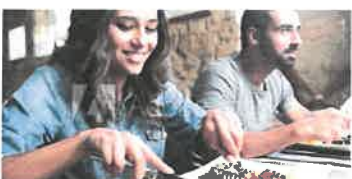
LOREM AMET CONS IPSUM DOLOR SIT → Tuesday, Jul 03, 2018