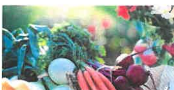
SIT AMET LOREM IPSUM DOLOR → Tuesday, Jul 03, 2018