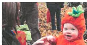
SPOOKTACULAR IS COMING! → Friday, Jul 06, 2018