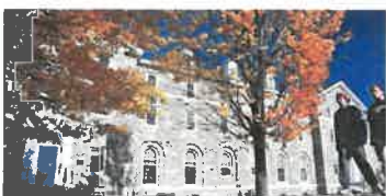
BACK TO SCHOOL IS COOL → Friday, Jul 06, 2018