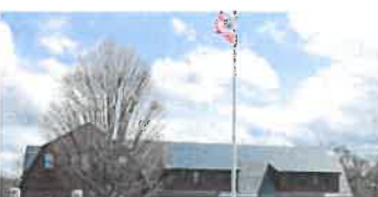
CONSECTETUR ADIPISICING ELIT SED DO EIUSMO → Tuesday, Jul 03, 2018