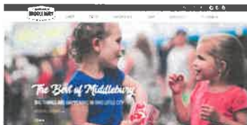
NEW EXPERIENCE MIDDLEBURY SITE LAUNCHES! → Friday, Jul 06, 2018