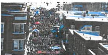
PREVIEW THE 2018 VERMONT CHILI FESTIVAL → Friday, Jul 06, 2018