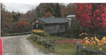
CILLUM DOLORE EU FUGIA! → Friday, Jul 06, 2018