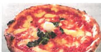
ADIPISICING ELIT → Tuesday, Jul 03, 2018