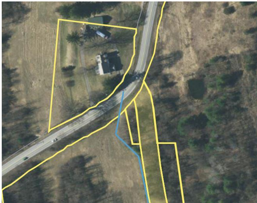
Bushey's Corner – Washington Street Extension