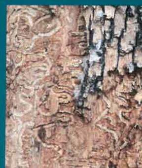
S- shaped tunnels

Learn. Get Involved. Make a difference. Visit: