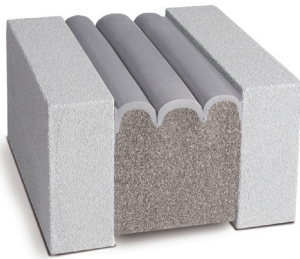
DSM SYSTEM sample shown here is displayed in substrate mock-up