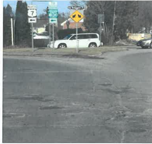
COURT SQUARE PAVEMENT BREAKUP