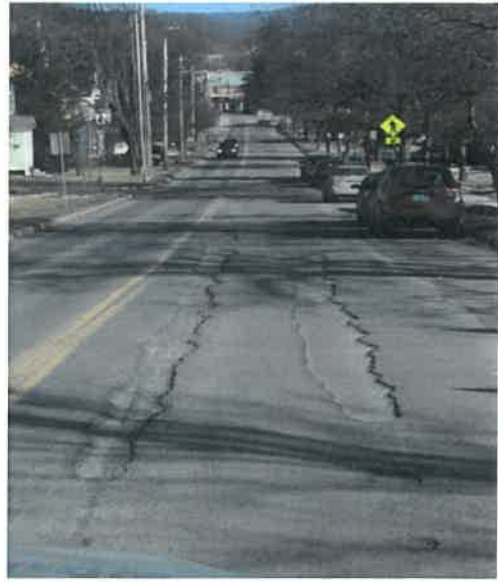
ROUTE 39 DELAMINATION