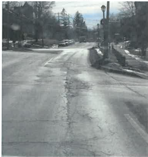
COURT SQUARE PAVEMENT RAVELING