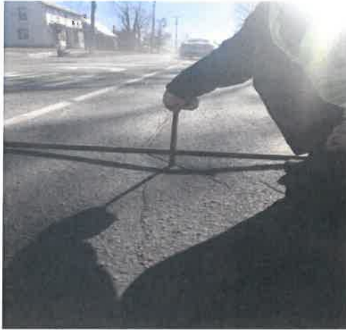
ROUTE 7 RUTTING