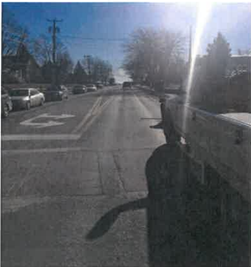
ROUTE 7 RUTTING