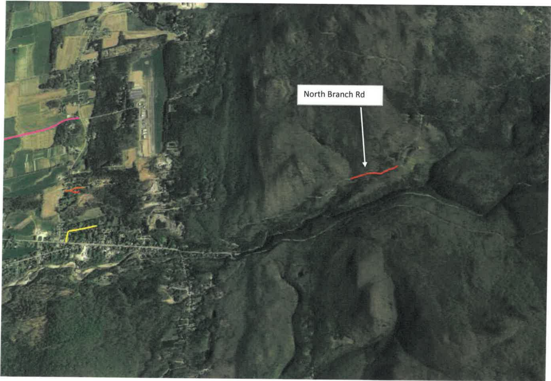
NORTH BRANCH ROAD in EAST MIDDLEBURY